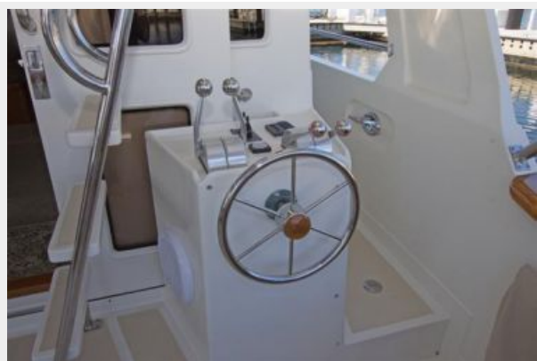
Cockpit Control Station