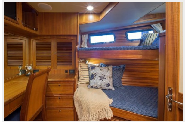
Port Guest Stateroom