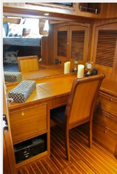
Desk in Guest Stateroom