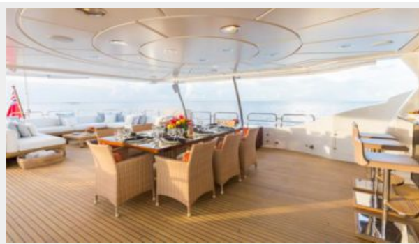
Upper Deck Area Dining for 8