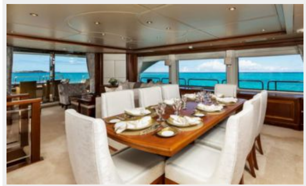
Main Salon Dining for 8