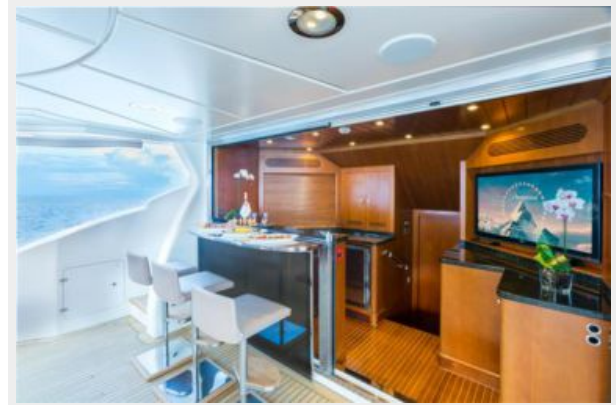
Upper Deck Bar and Stew Pantry