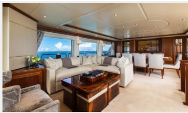
Main Salon looking from Aft Deck Entry Door