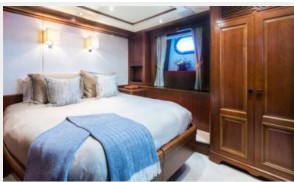
Twin Cabin Converted to Queen