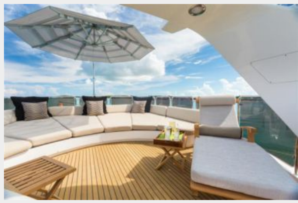
Sun Deck Lounge chairs/ Sun Beds