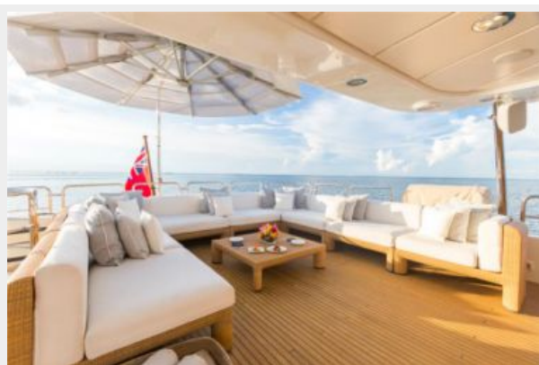
Upper Deck Lounge