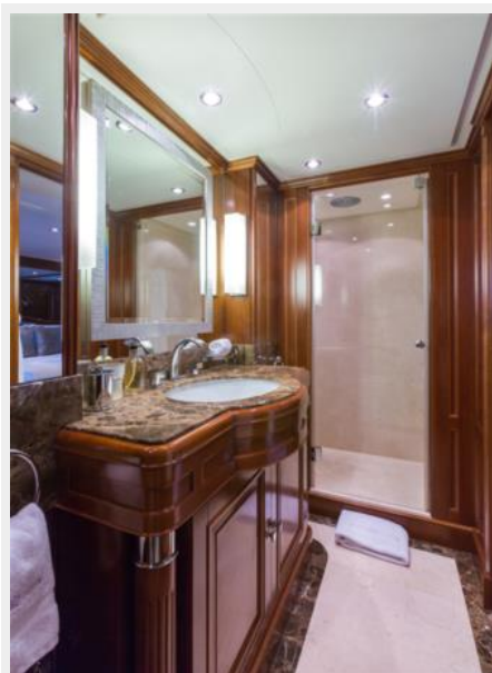
VIP En-Suite Bathroom