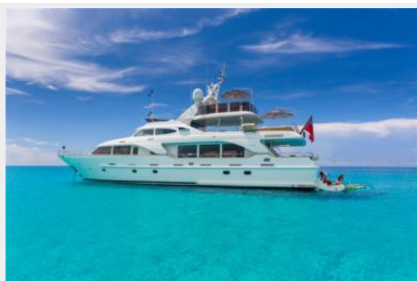
Beach Club/ Swim Platform