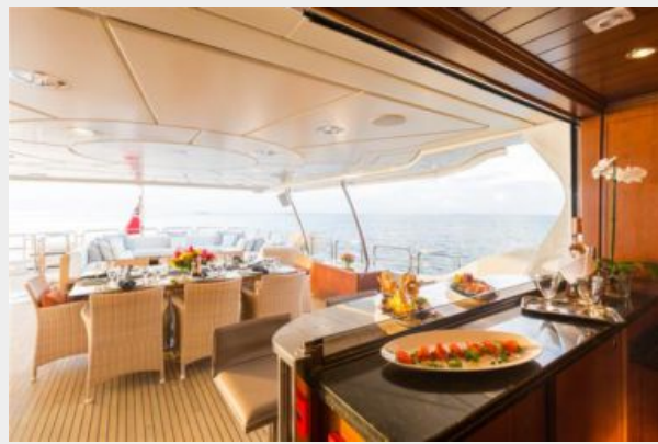
Upper Deck Bar and Dining for 8