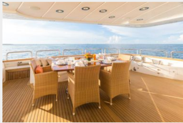
Aft Deck Al Fresco Dining