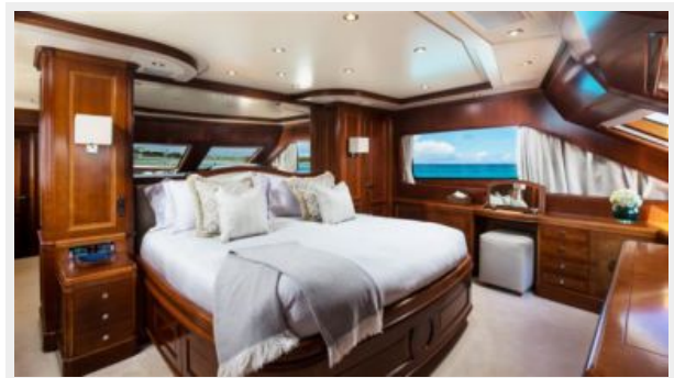
Master On Deck