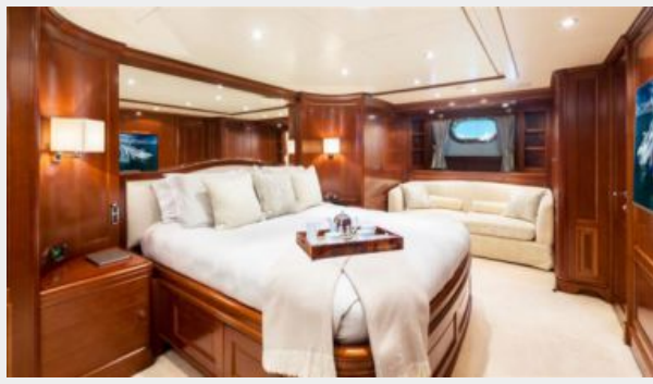
VIP Cabin Aft