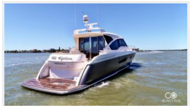
Starboard Profile Idle