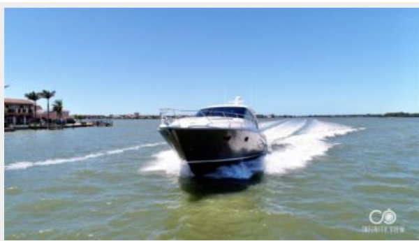
Starboard Profile Idle