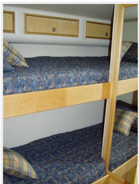
Guest Stateroom #2