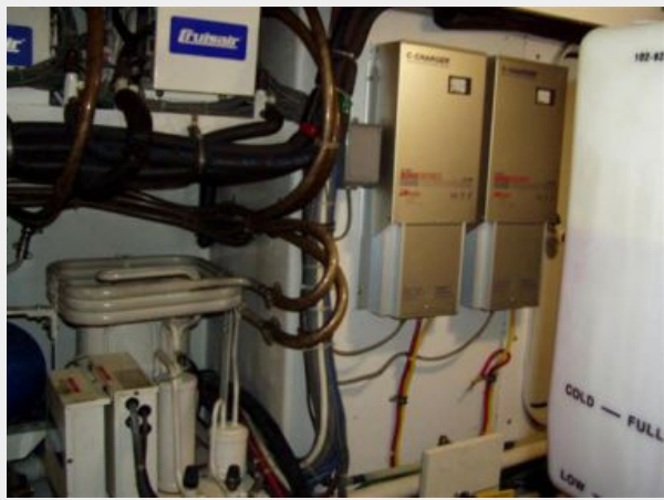
Forward Starboard Engine Room