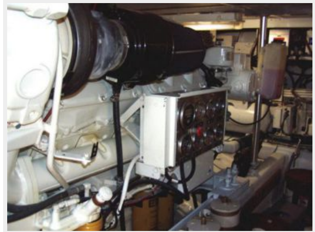
Port CAT 3412 DITA