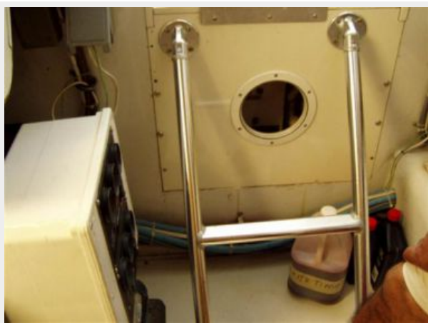
Eskimo Shreaded Ice Maker to Fish Box in Cockpit