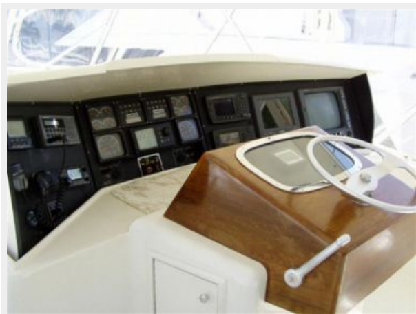
Flybridge Helm Electronics