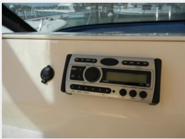
Cockpit Stereo AM/FM/CD