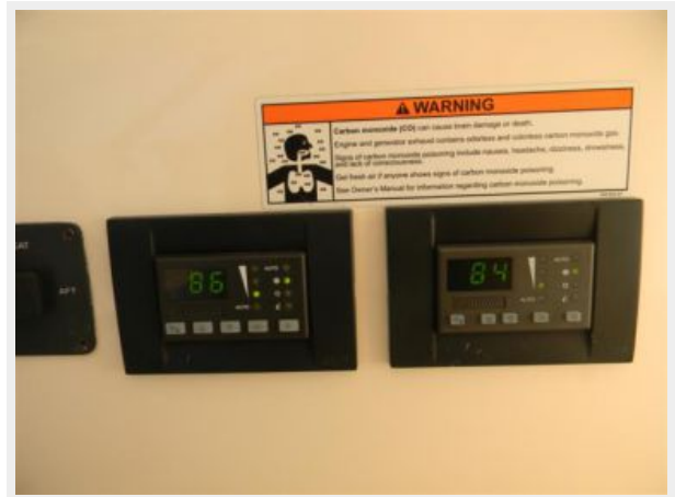
Cockpit AC - 2 Units