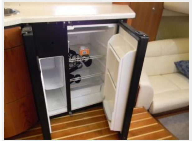
Galley Refrigerator / Freezer