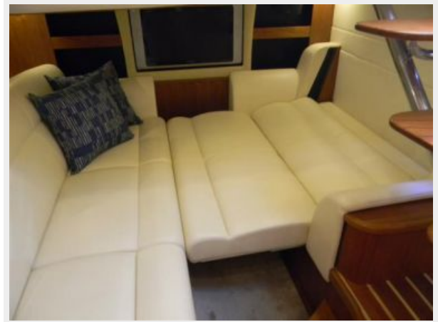
Theater Room Converted