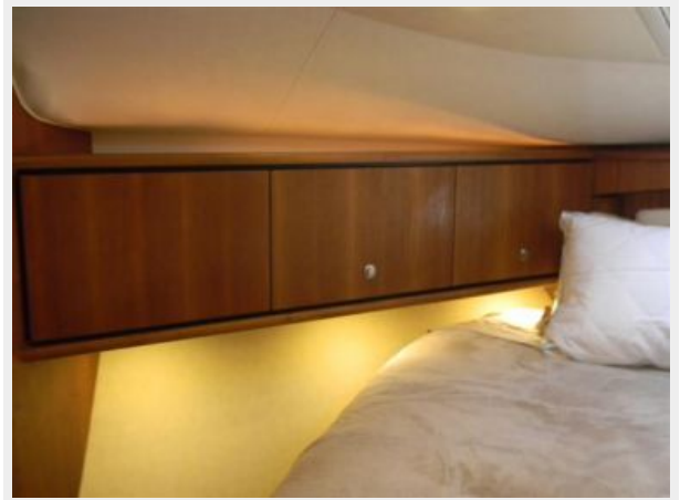
Master Stateroom Upper Storage Cabinets