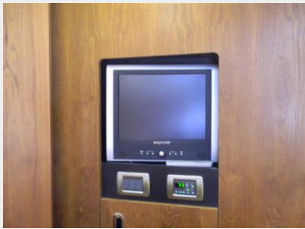
Master Stateroom TV