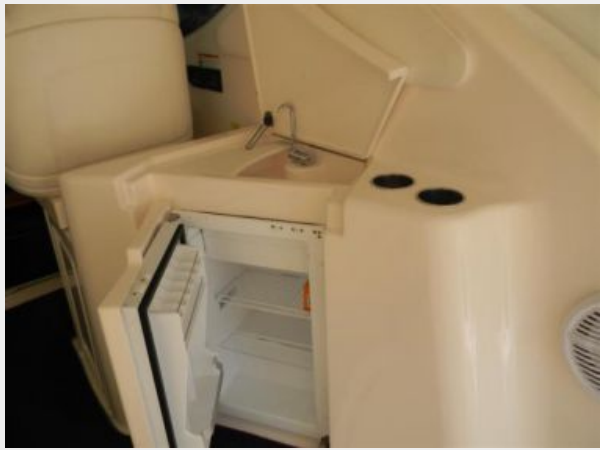
Cockpit Wetbar and Refrigerator