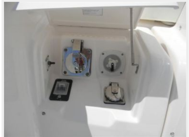
50 Amp Cable Master