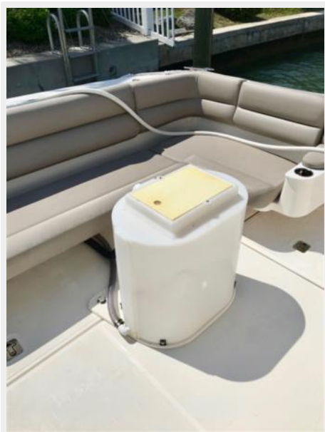
Portable Live Well