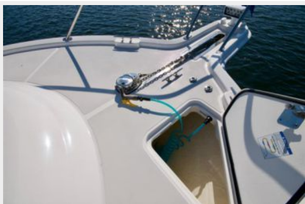
Fresh Water Washdown