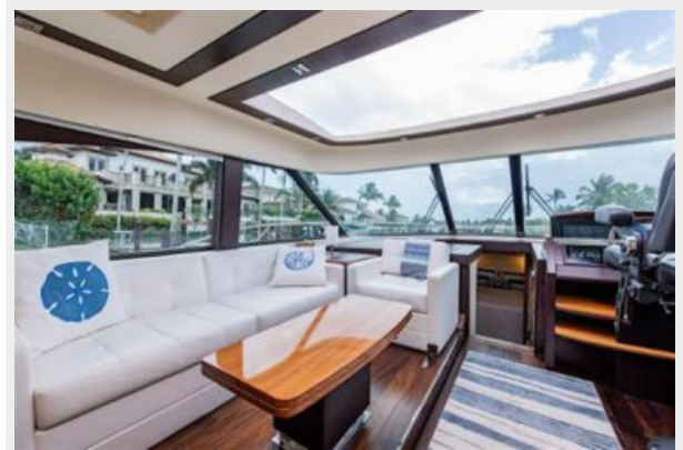
Salon Sunroof Open