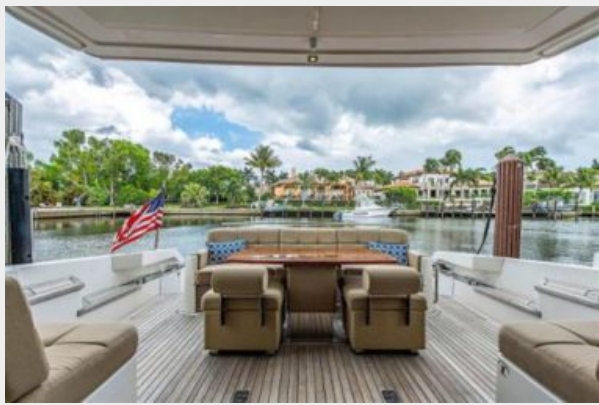
Cockpit No Shade