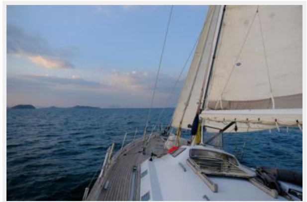
Deck and sailing