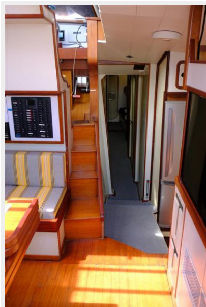
from companionway to sail locker