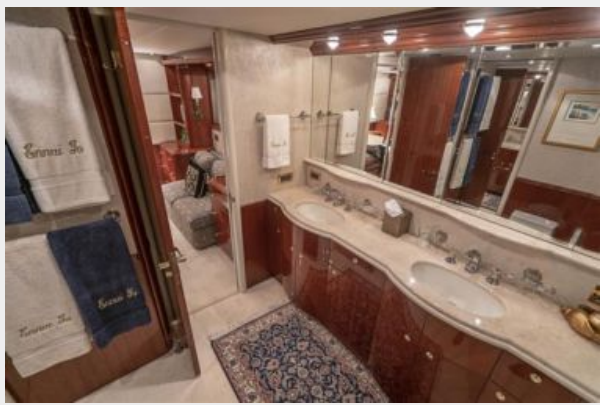
Master Stateroom Ensuite Head