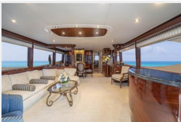
Forward View Grand Salon