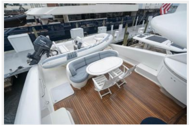
Skylounge Aft Deck / Tender