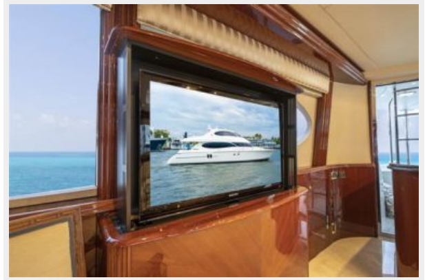
Main Salon 40" HD Pop Up TV