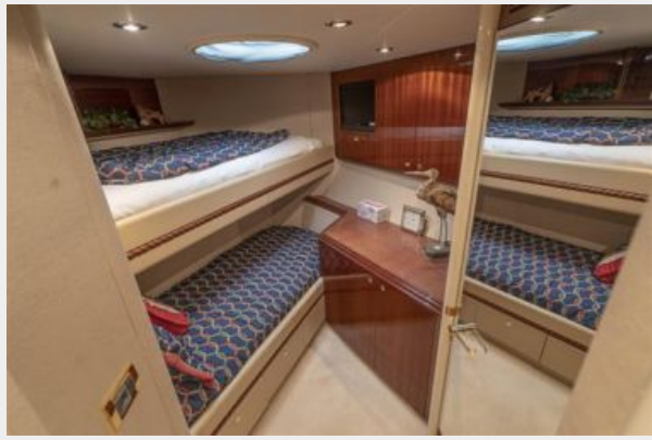
Forward Crew Cabin