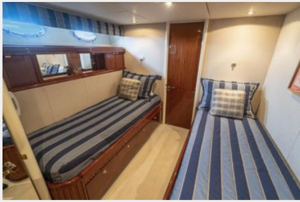
Starboard Guest Twin Berth Stateroom