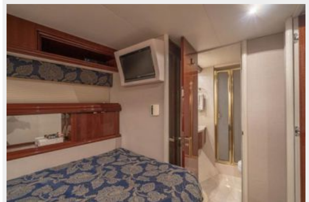
Forward Captains Cabin