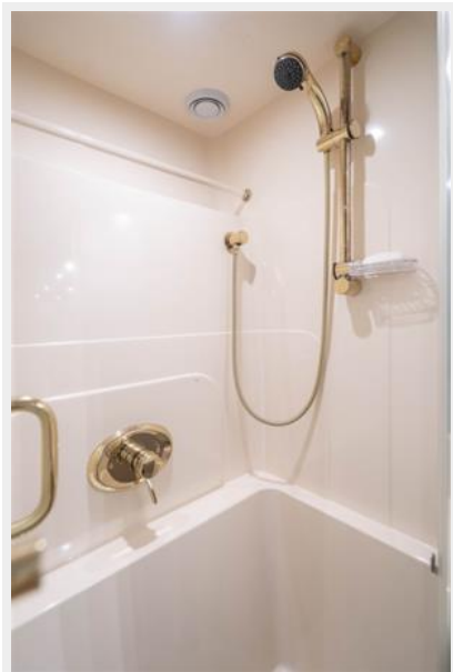
Port Guest VIP Shower