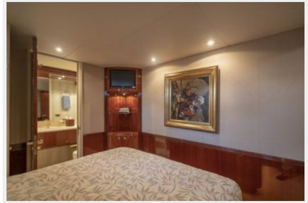
Port Guest VIP Stateroom