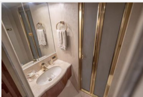
Forward Port Captain Ensuite Head