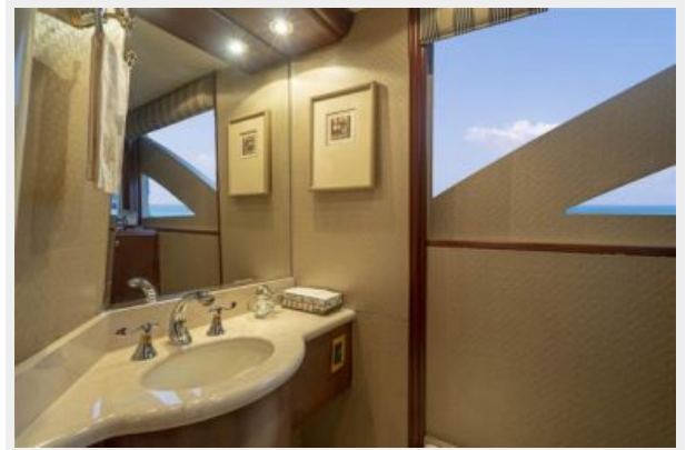
On Deck Day Head