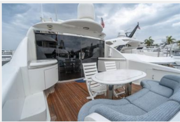
Skylounge Aft Deck