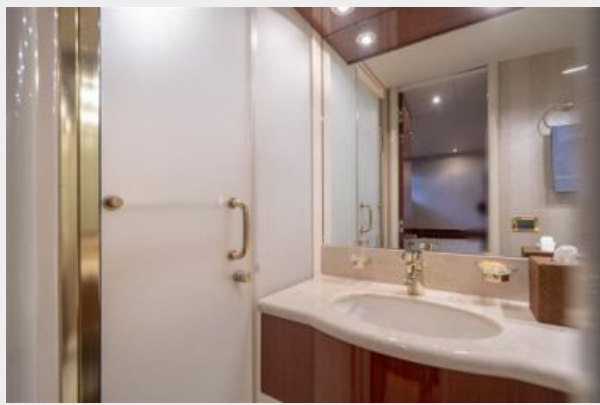
Port VIP Guest Head