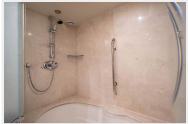
Master Stateroom Jacuzzi Tub / Shower