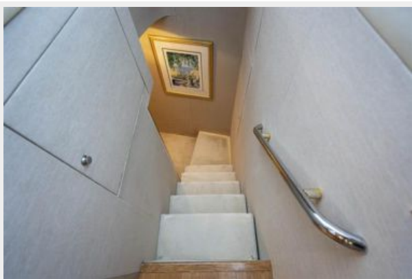
Forward Stairwell to Crew Quarter's