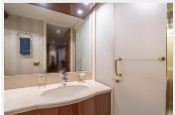
Starboard Ensuite Guest Head