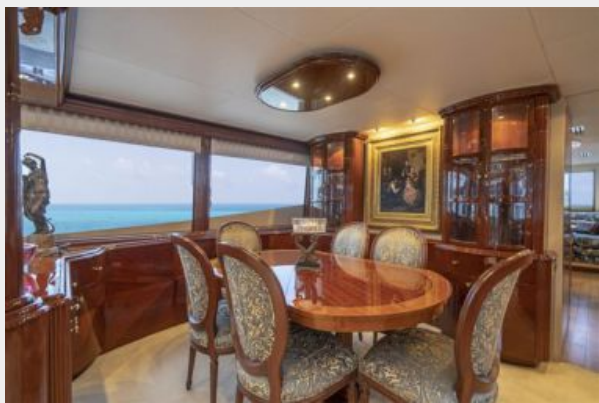
Main Salon Formal Dining