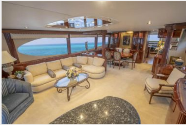
Grand Main Salon