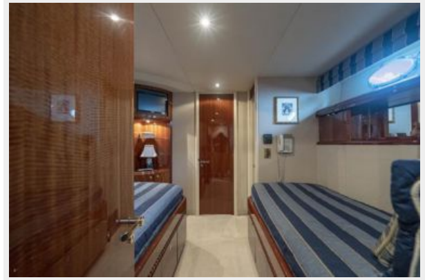
Starboard Twin Berth Guest Stateroom