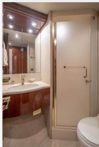
Forward Crew Cabin Ensuite Head