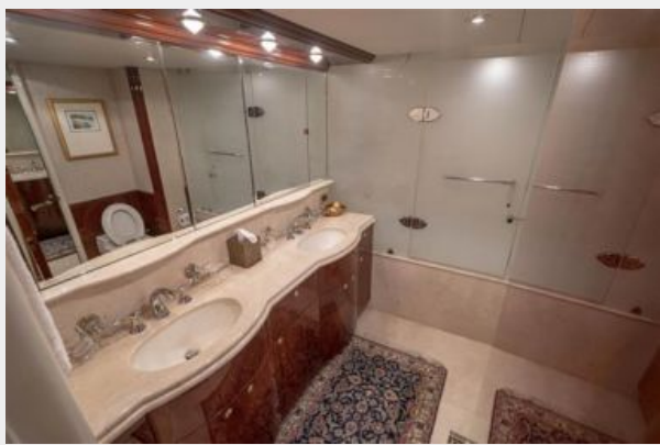
Master Stateroom Head