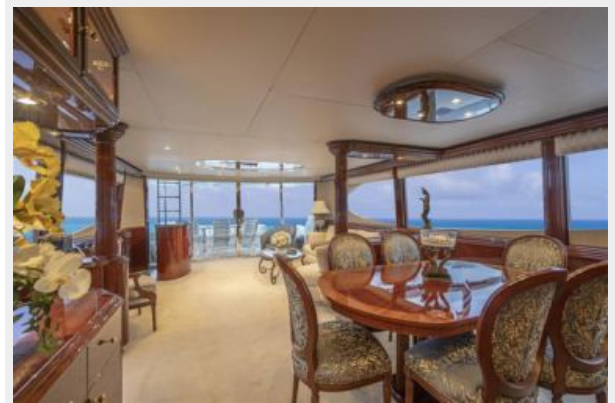
Grand Main Salon