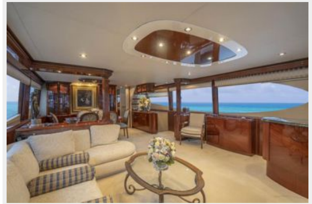
Forward View Grand Salon