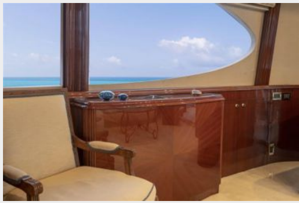
Hi / Lo TV Cabinet