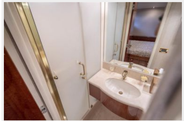
Port Guest VIP Head