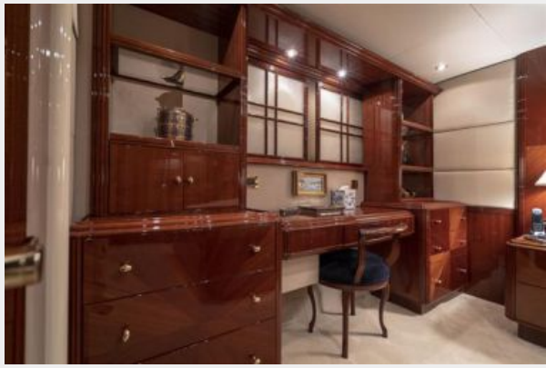
Master Stateroom Desk / Vanity