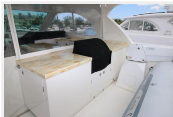
FLY BRIDGE ACCESS AND PORT SIDE AFT DECK CONTROLS