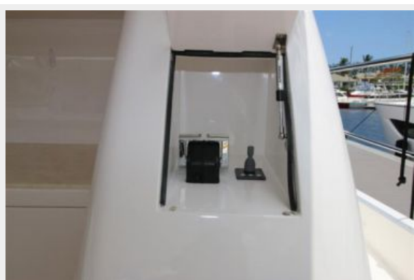
STARBOARD SIDE AFT DECK CONTROLS