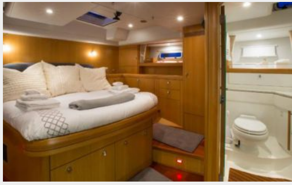
Owner's Cabin, Port Side