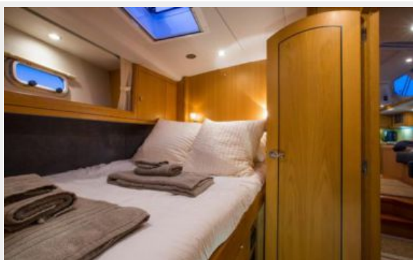
Stbd. Guest Cabin, Looking Aft