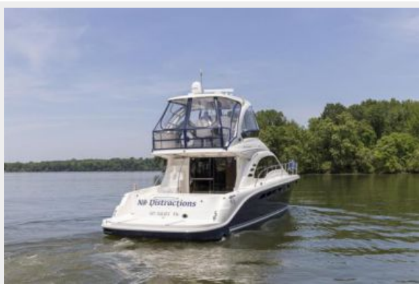
STBD quarter profile