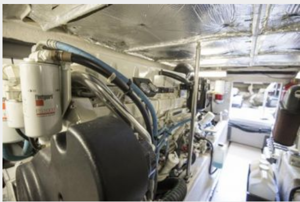
Engine room 4