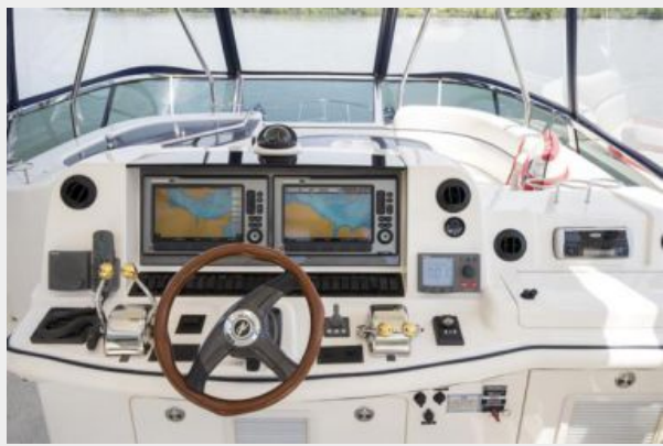
Helm view 2