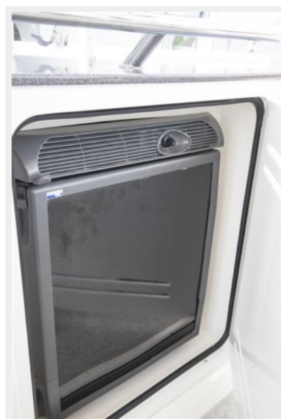
Norcold refrigerator at the bridge