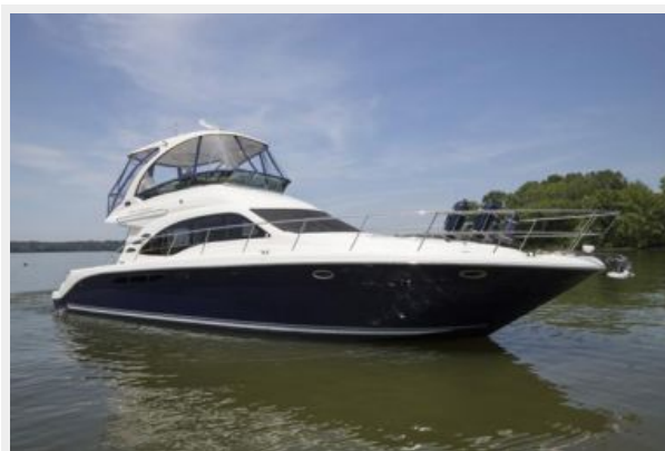
STBD bow profile