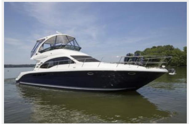
STBD bow profile