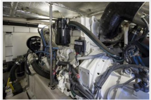
Engine room 3