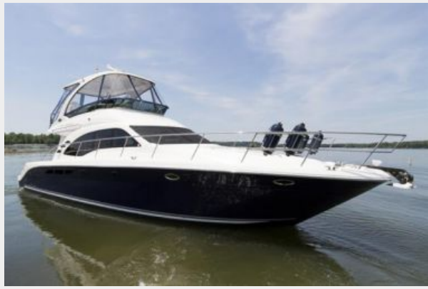
STBD bow profile 2