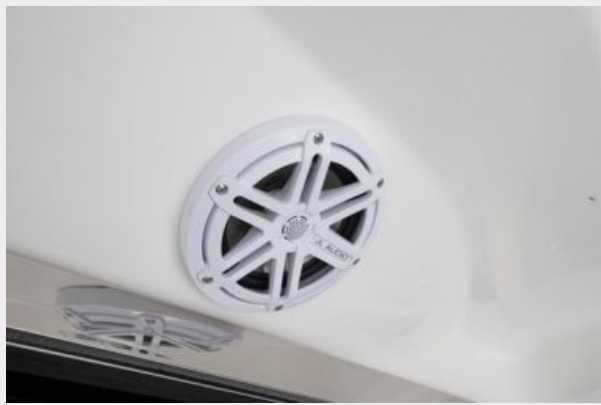
JL audio speaker in cockpit