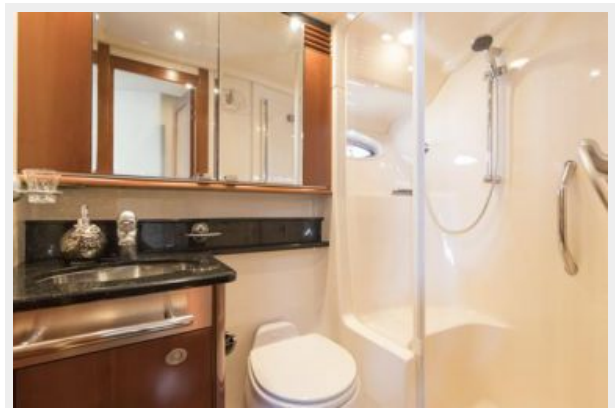
Master head with shower