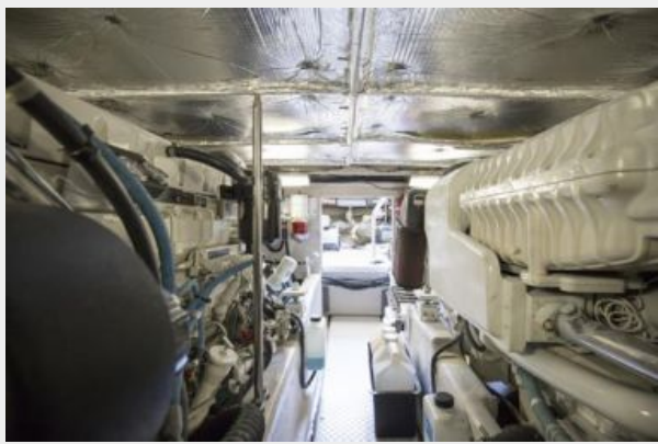
Engine room 2