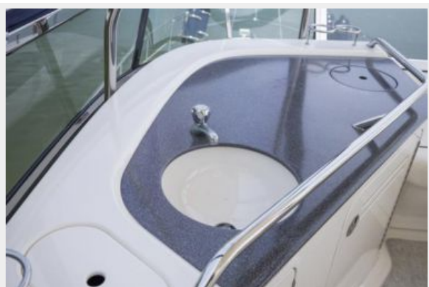
Sink at the bridge