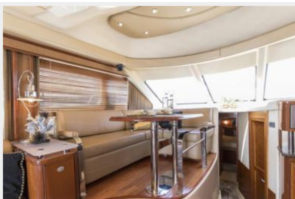
Dinette view 2