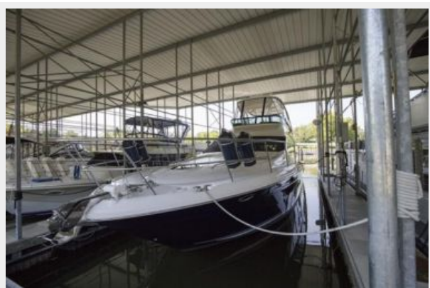
Port bow profile (in slip)