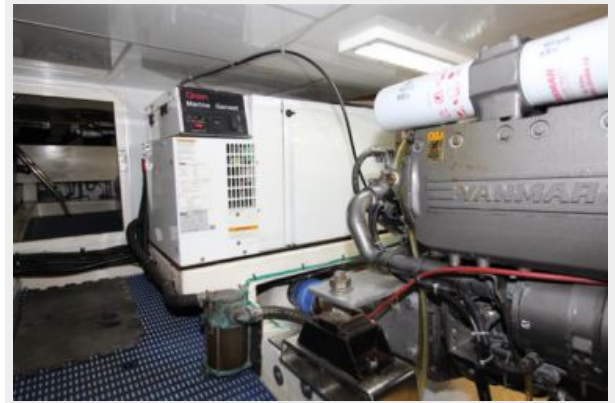
Onan 13.5 kW Generator