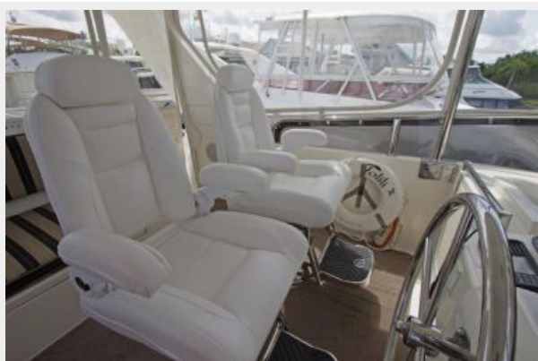
New FB Helm Seats