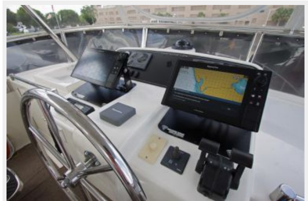
FB Helm Nav. Electronics