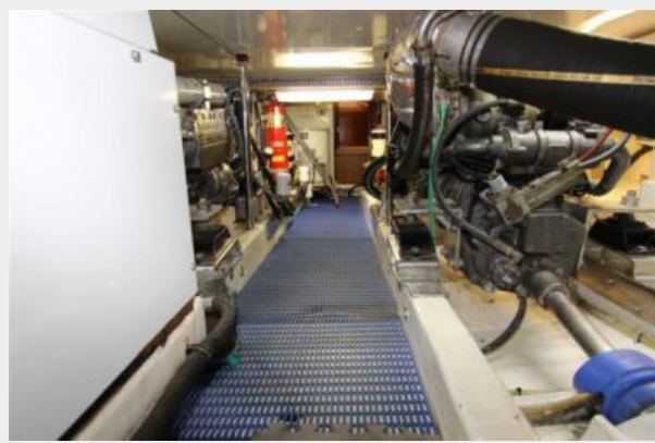
Engine Room Looking Forward