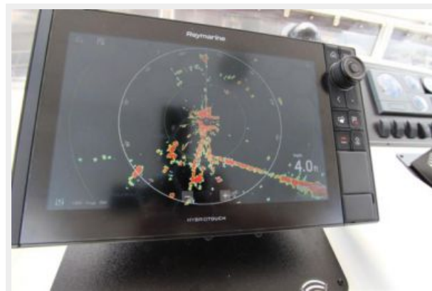
Flybridge New Axiom Port Display