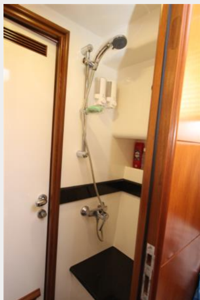
Guest Head Shower