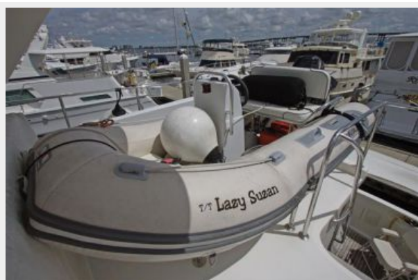
Tender on FB Boat Deck