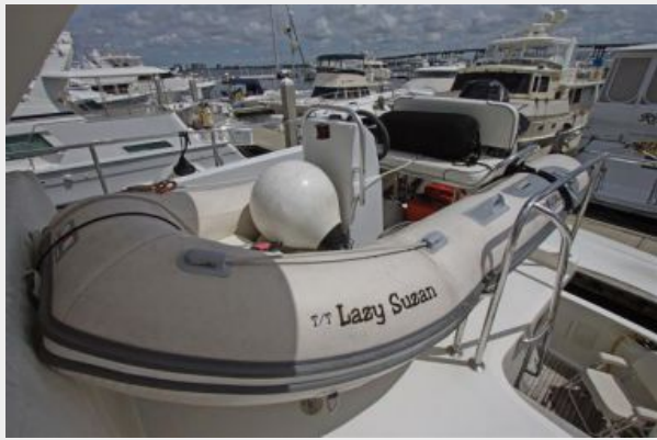
Tender on FB Boat Deck