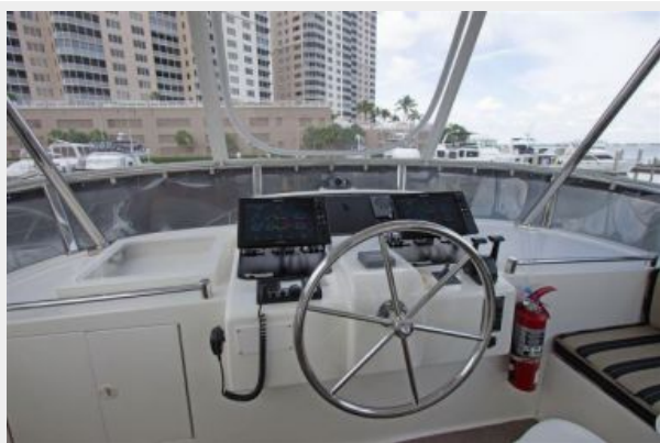
FB Helm Console