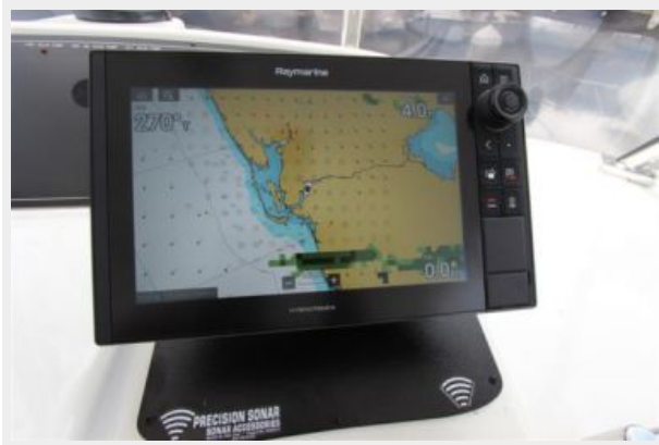
Flybridge New Axiom Starboard Display