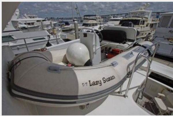
Tender on FB Boat Deck