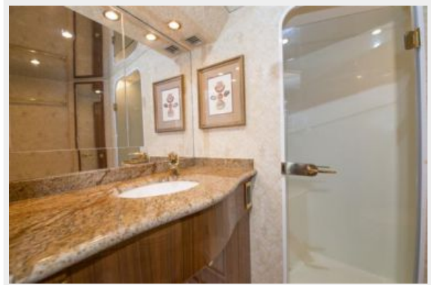
2006 Viking 61 Convertible - Master Stateroom Head