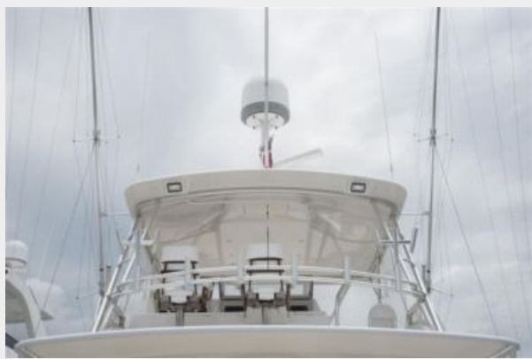
2006 Viking 61 Convertible - Flybridge