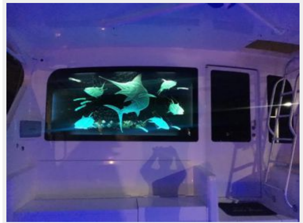
2006 Viking 61 Convertible - Cockpit