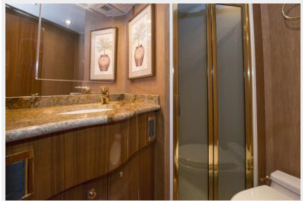
2006 Viking 61 Convertible - Guest Head