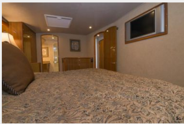
2006 Viking 61 Convertible - Master Stateroom