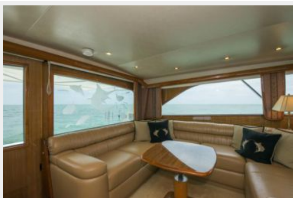
2006 Viking 61 Convertible - Salon