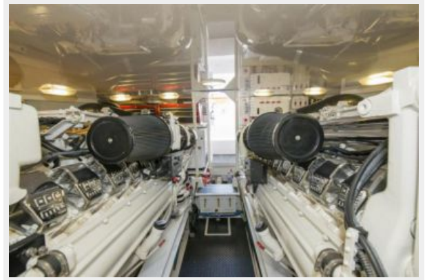
2006 Viking 61 Convertible - Engine Room