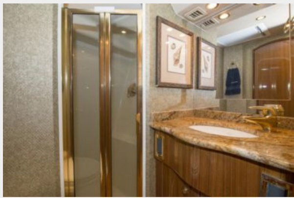
2006 Viking 61 Convertible - Guest Head