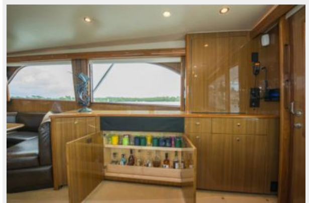
2006 Viking 61 Convertible - Salon