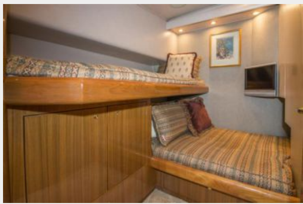
2006 Viking 61 Convertible - Guest Stateroom