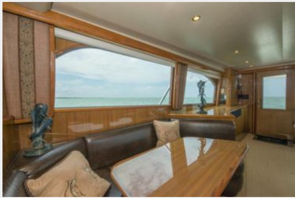
2006 Viking 61 Convertible - Dinette