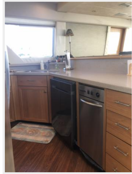
On Deck Galley