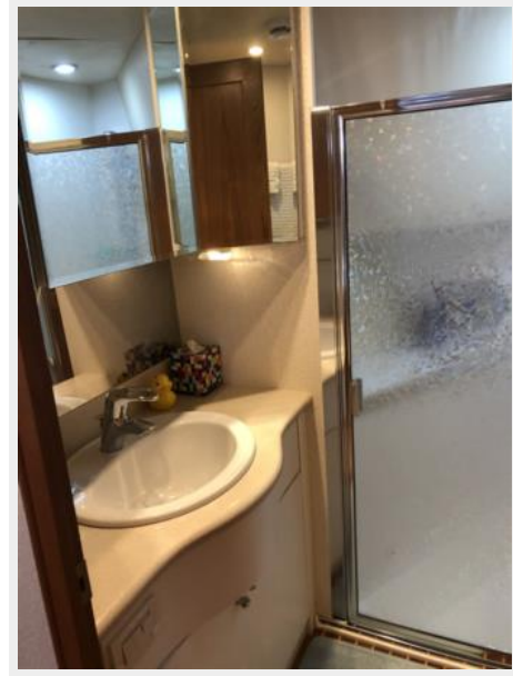
Forward VIP Stateroom Head