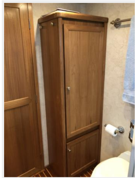
Master Head Custom Linen / Cloth Hamper Cabinet