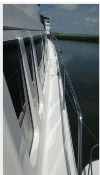
Walk-around Side Deck