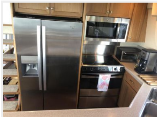
Galley / Upgraded Refrigerator & Microwave 2017