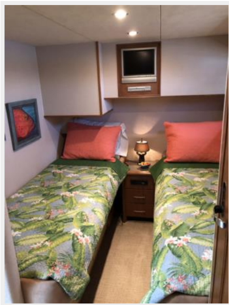
Port Guest Twin Berth Stateroom