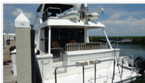
Swim Platform / Aft Deck