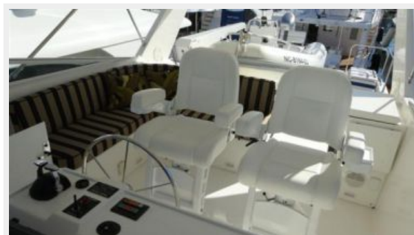
Flybridge Helm & Companion Seats