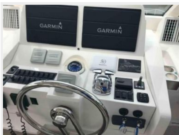
G/A BRIDGE DECK