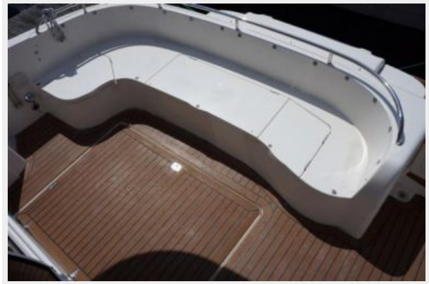
1998 Sealine F44 Flybridge Cruiser Motor Yacht cockpit seating