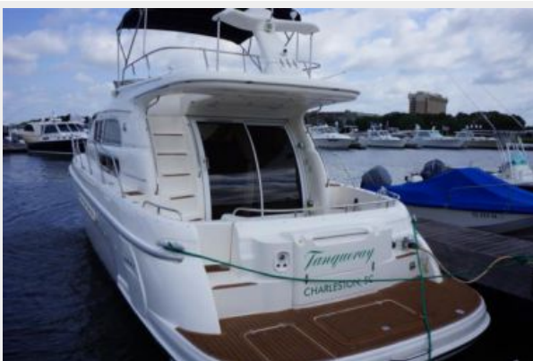
1998 Sealine F44 Flybridge Cruiser Motor Yacht port aft