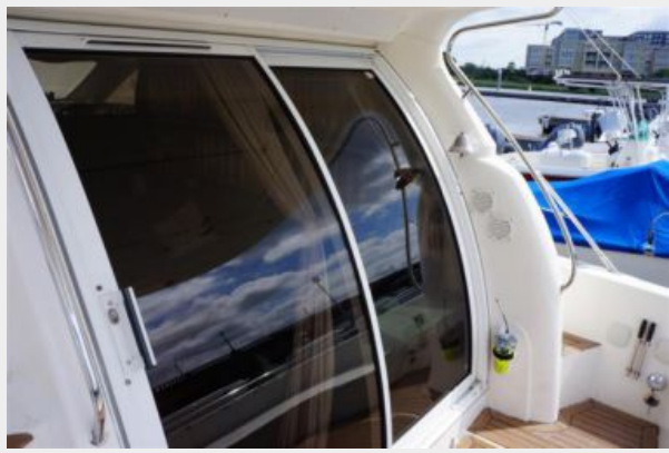
sliding cockpit doors