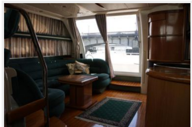
main saloon looking aft