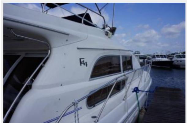
1998 Sealine F44 Flybridge Cruiser Motor Yacht starboard