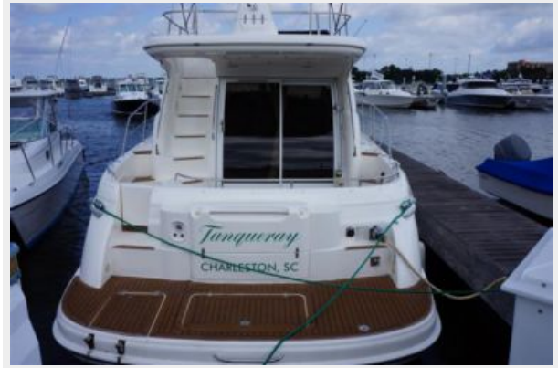
1998 Sealine F44 Flybridge Cruiser Motor Yacht stern