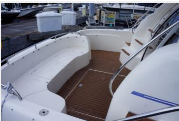
1998 Sealine F44 Flybridge Cruiser Motor Yacht aft cockpit