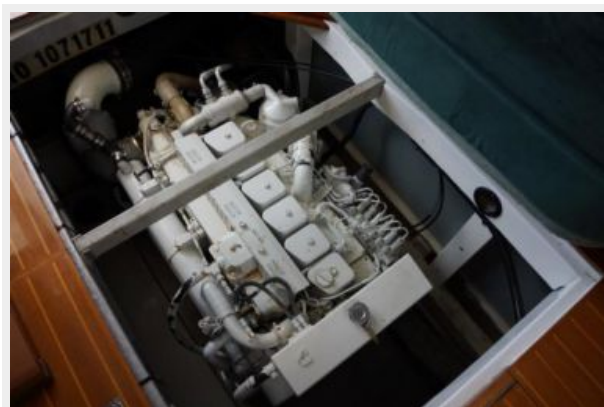
twin cummins diesel power