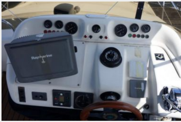
1998 Sealine F44 Flybridge Cruiser Motor Yacht upper helm