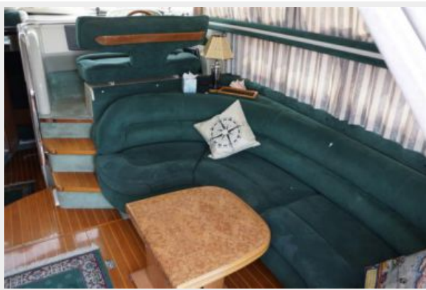
main salon seating