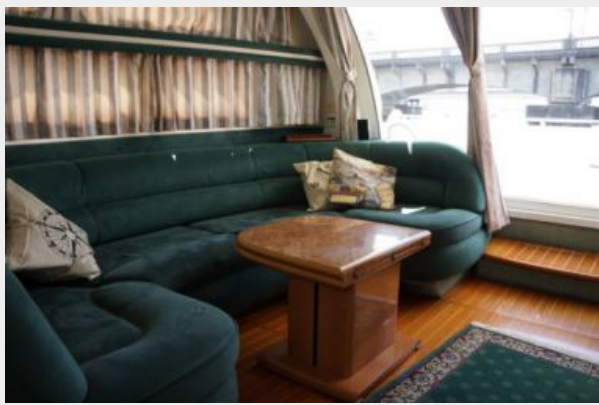
main salon starboard sofa