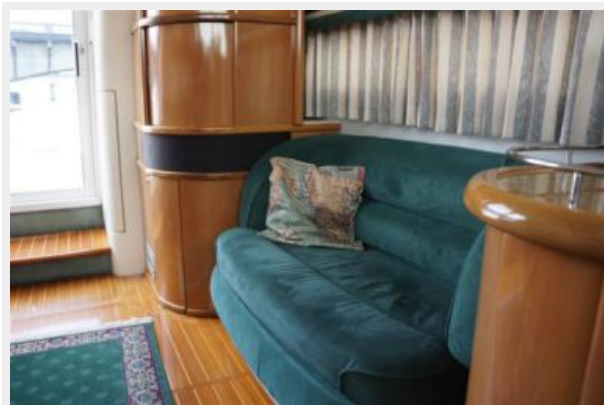
port sette in main saloon