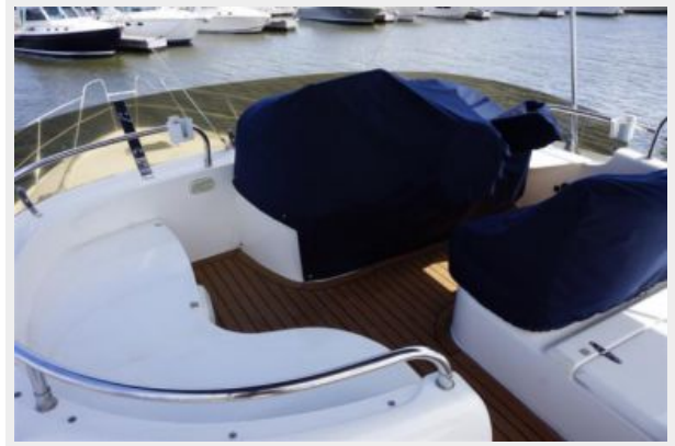
upper helm seating