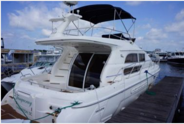
1998 Sealine F44 Flybridge Cruiser Motor Yacht starboard aft