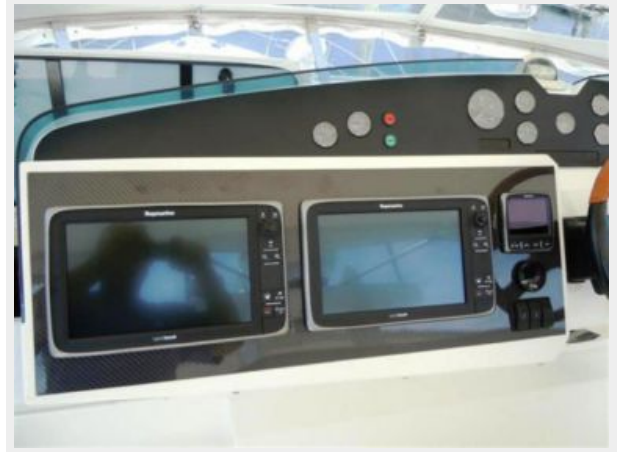
Upper Helm Electronics