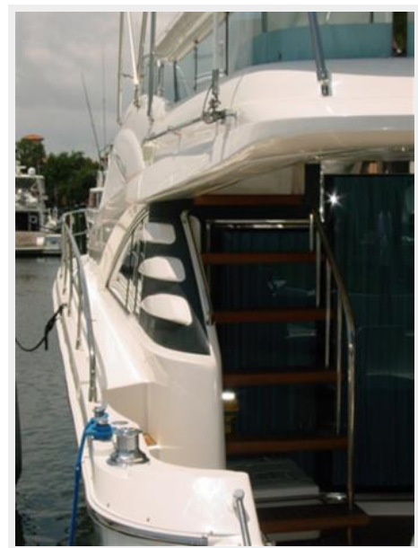
Starboard Aft Qtr