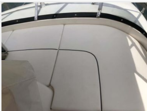
Flybridge Sunpad Cushions