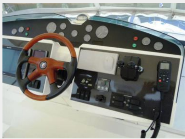
Upper Helm - Windshield