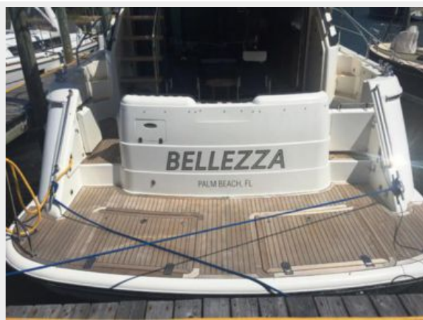
Teak - like new!