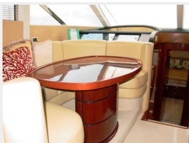
Salon Seating - sistership