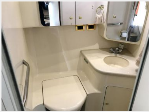
day head with sink