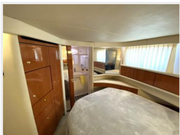
large aft cabin with ensuite