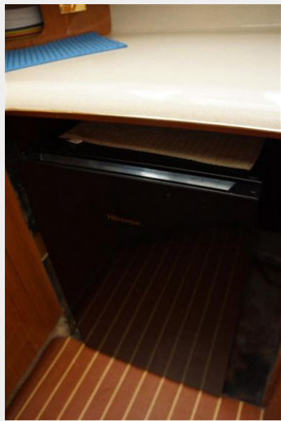
new refrigerator and freezer