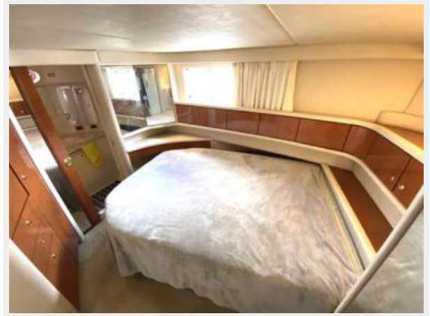
spacious aft cabin