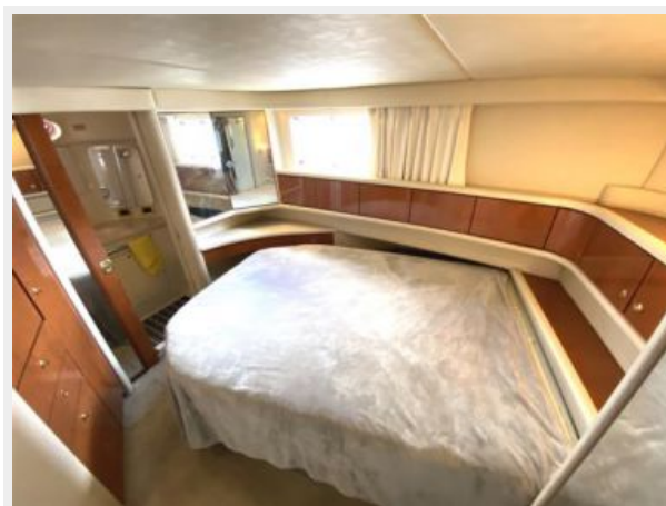
spacious aft cabin