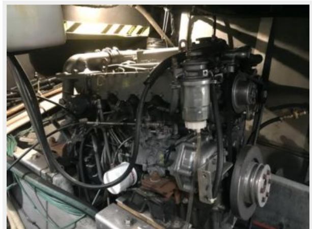
2002 Yanmar 100hp diesel