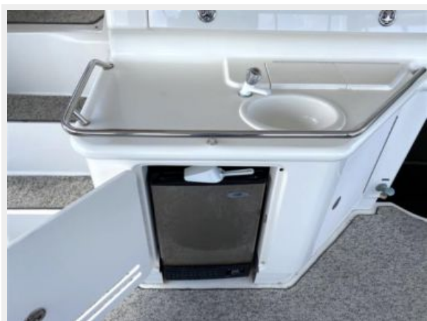
wet bar with sink and ice maker