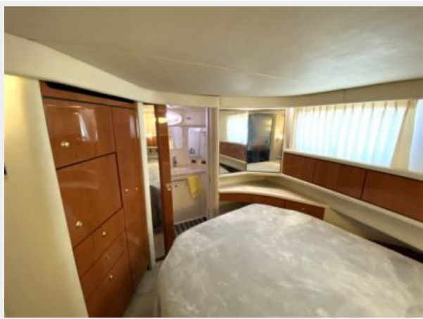
large aft cabin with ensuite