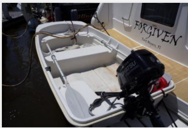
10 ft Sun Dolphin and Outboard