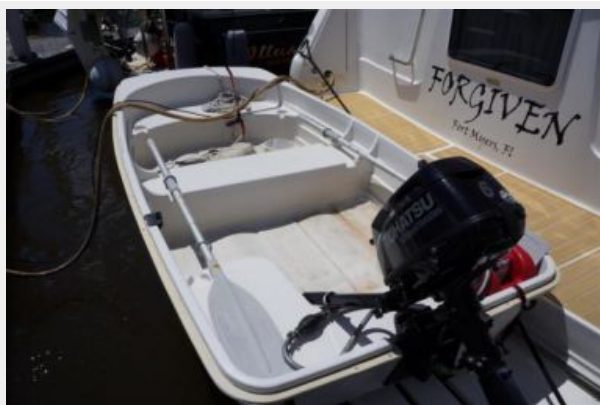
10 ft Sun Dolphin and Outboard