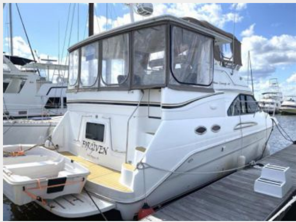
1998 Sea Ray 370 Aft Cabin