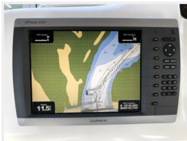
Garmin GPSmap chart plotter