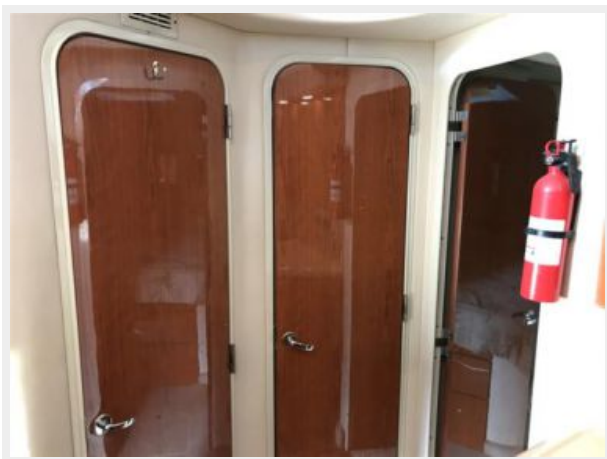
passageways below decks