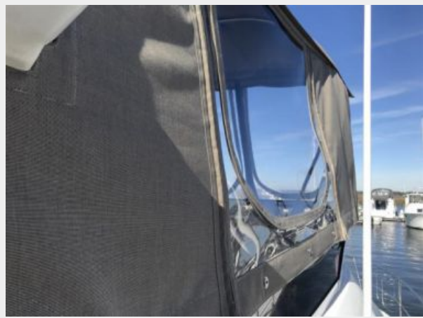
new canvas and isinglass