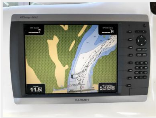
Garmin GPSmap chart plotter