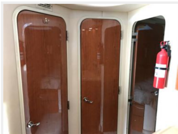
passageways below decks