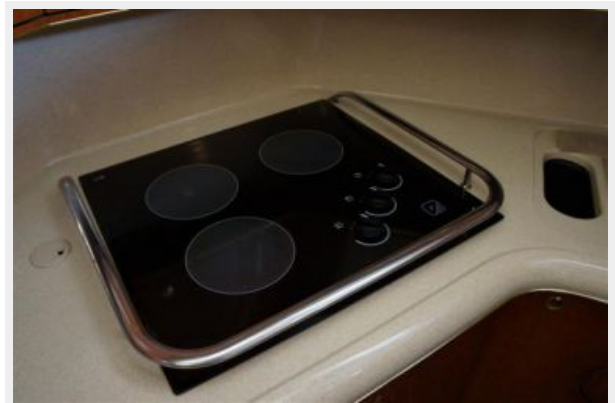
3-burner electric cooktop