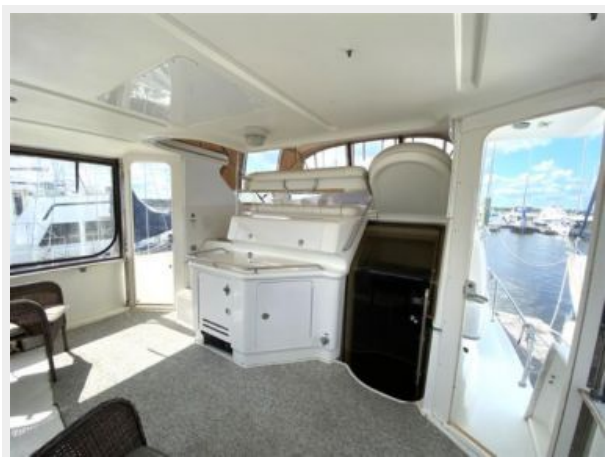
1998 Sea Ray 370 Aft Cabin sun deck