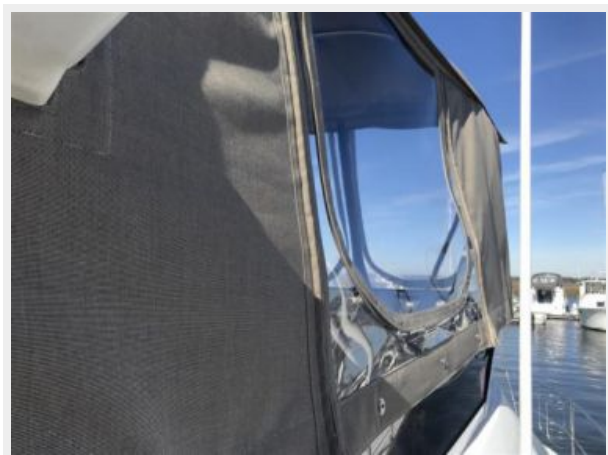
new canvas and isinglass