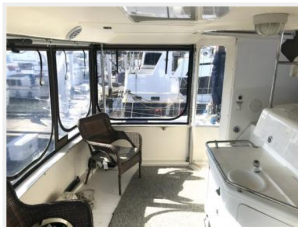
covered sun deck