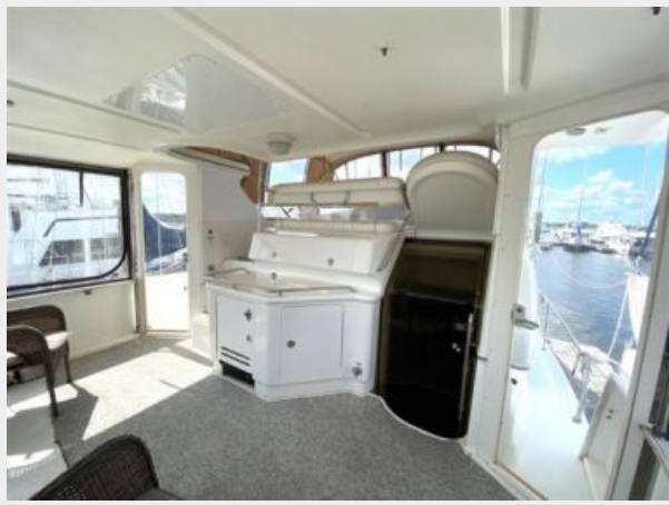
1998 Sea Ray 370 Aft Cabin sun deck