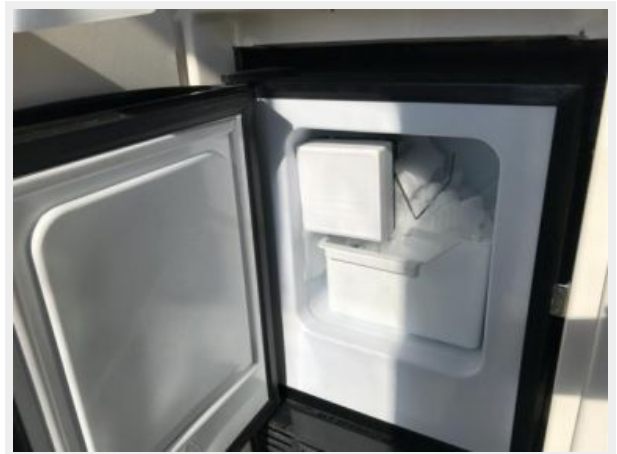
YES - the ice maker works!