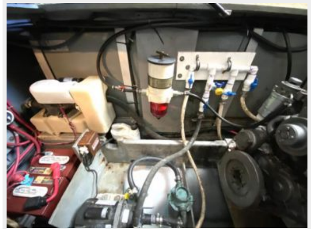
clean and organized engine room