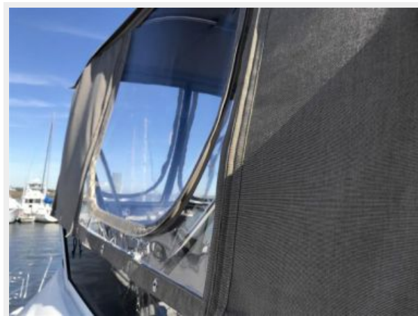
New canvas and isinglass