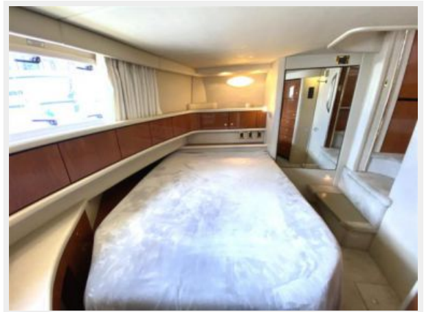
aft cabin looking port