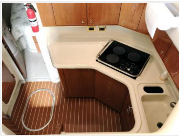
large galley with refrigerator, stove top, and sink