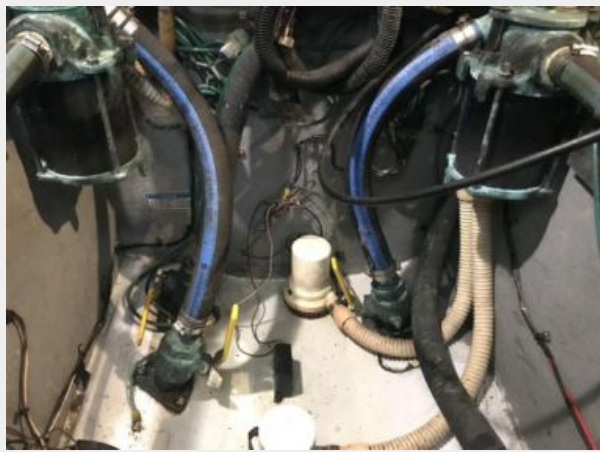
dry and clean bilge