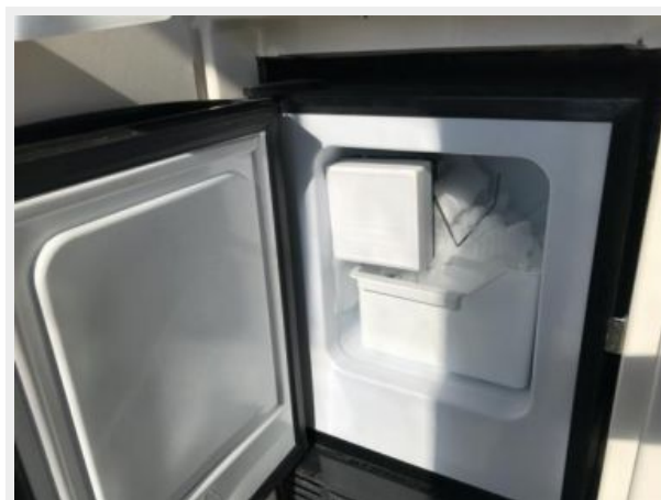
YES - the ice maker works!