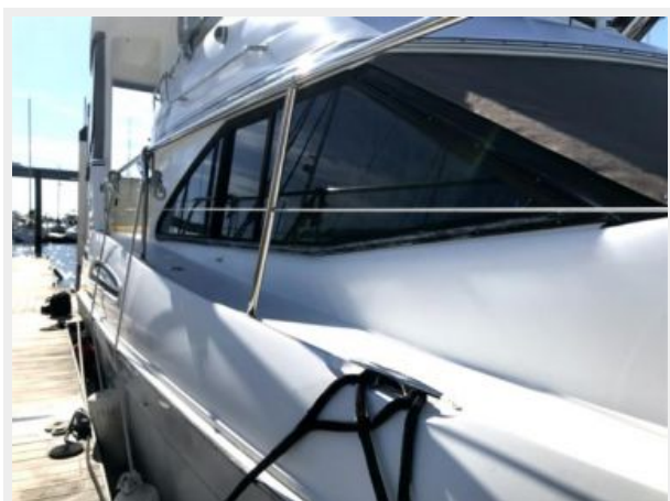
1998 Sea Ray 370 Aft Cabin