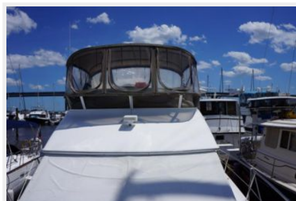
flybridge with all new canvas