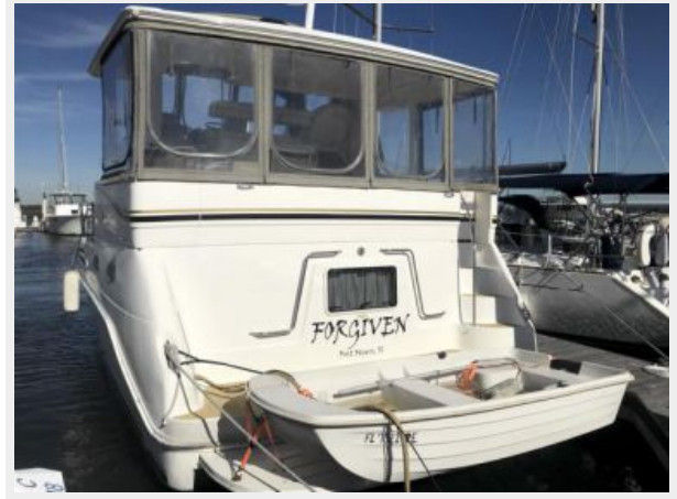
1998 Sea Ray 370 Aft Cabin & 10 ft Sun Dolphin