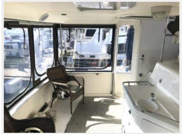
covered sun deck