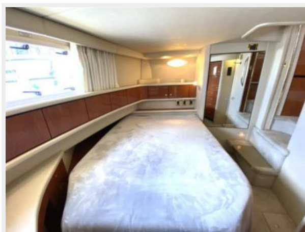
aft cabin looking port