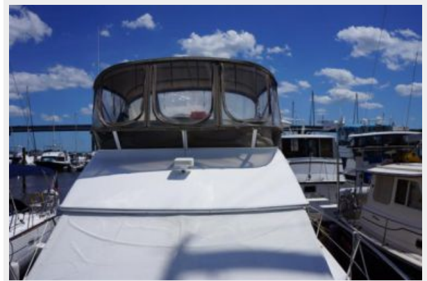
flybridge with all new canvas