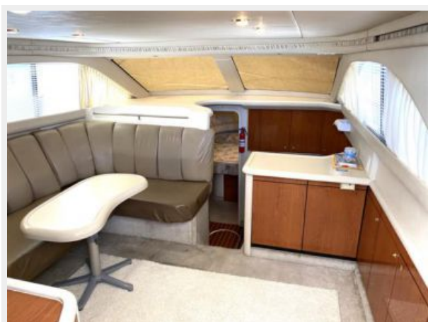
Spacious sunlit main salon