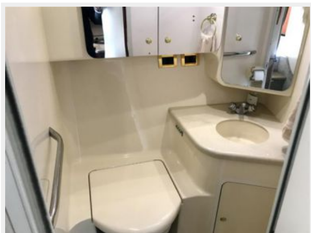
day head with sink