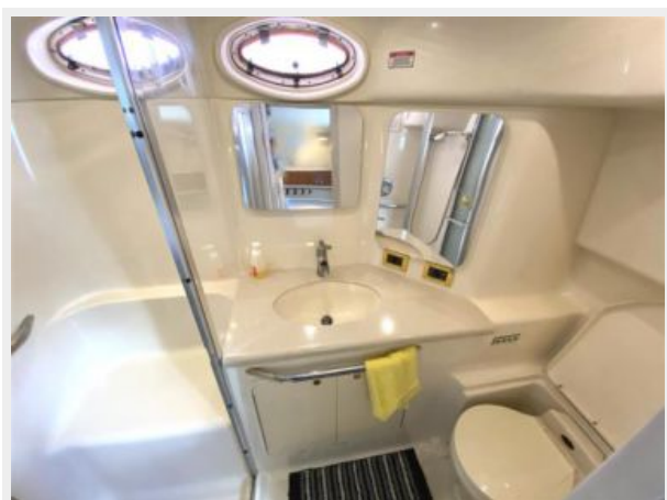
ensuite with shower, sink, head