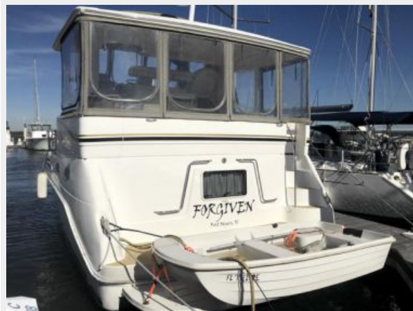
1998 Sea Ray 370 Aft Cabin & 10 ft Sun Dolphin