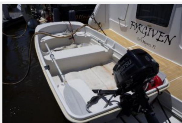
10 ft Sun Dolphin and Outboard