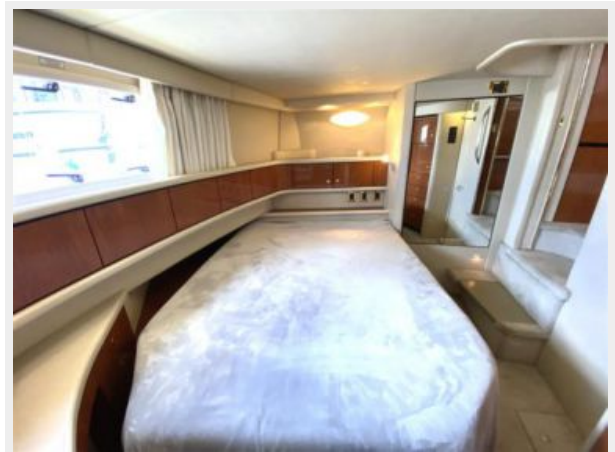
aft cabin looking port