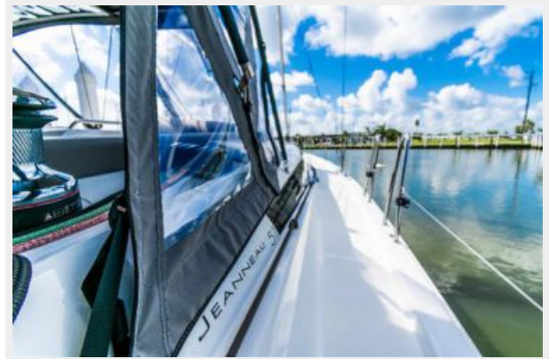
Walkway to Bow