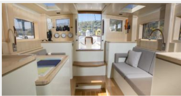
deckhouse looking aft