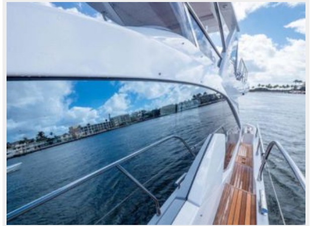
Port Side Deck Looking Aft