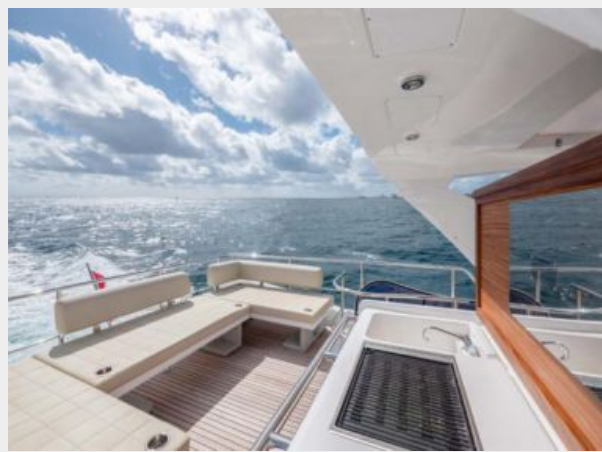
Bridge Wet Bar and Seating