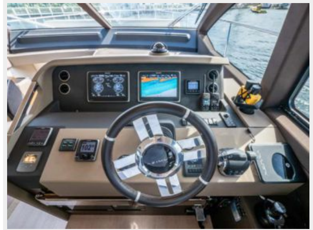
Lower Helm Electronics