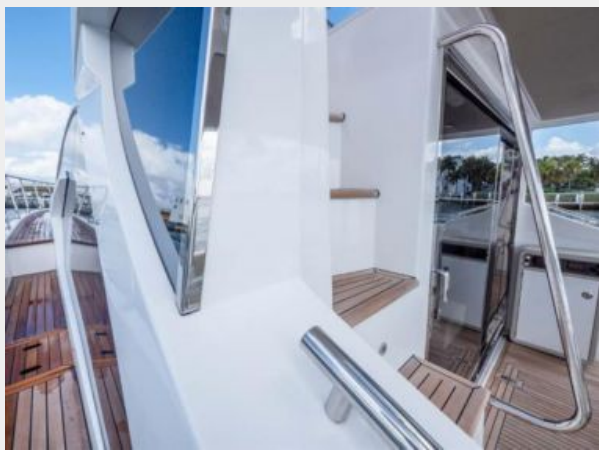
Starboard Side Deck Looking Forward