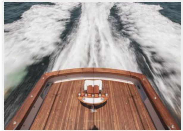
Cockpit - view from Bridge