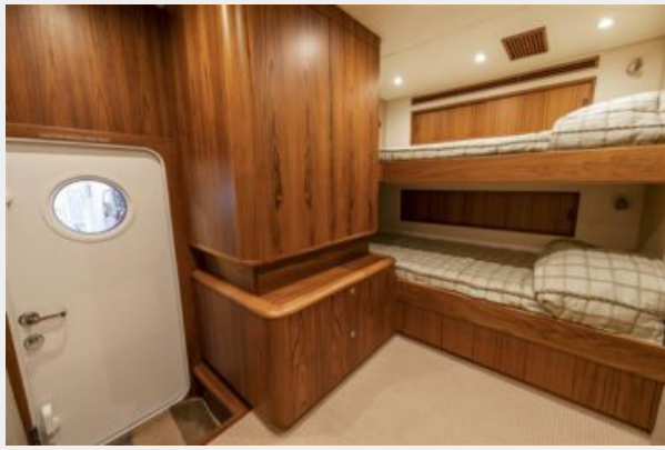
Crew/Guest Stateroom - Port