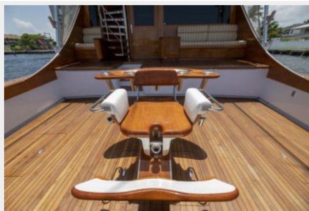
Fighting Chair / Cockpit