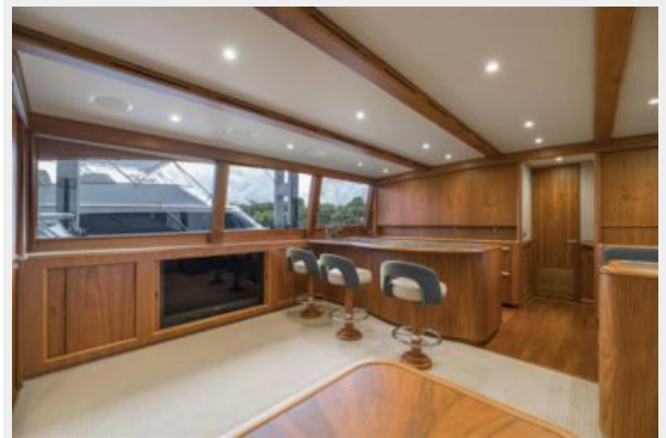
Salon - Entertainment Center to Port