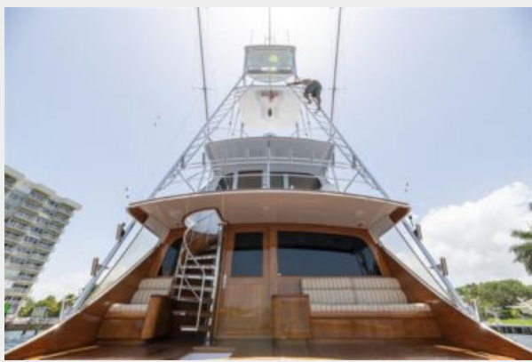
Aft - View up to Tower