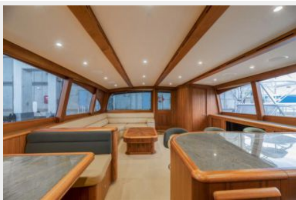
Salon - looking aft from Galley/Dinette