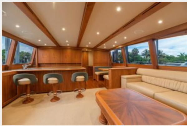
Salon - looking forward to Galley/Dinette