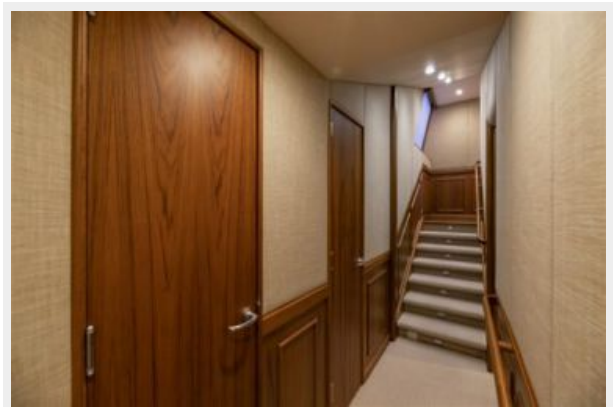
Companionway - looking aft