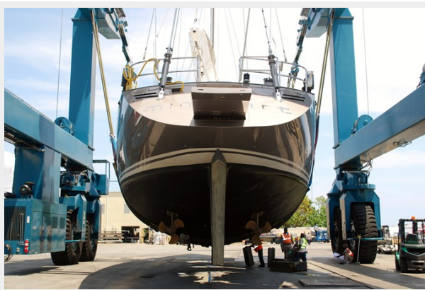
MINISKIRT - out of the water (3)