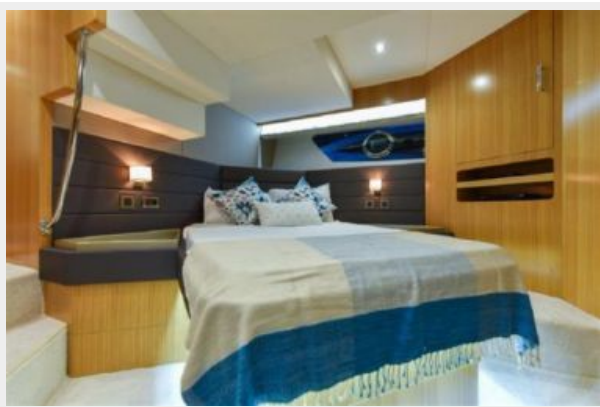
Master cabin 1