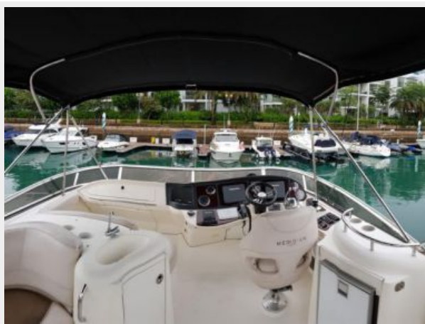
Flybridge looking forward