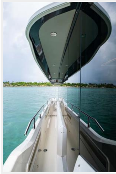
Starboard Side Deck to aft