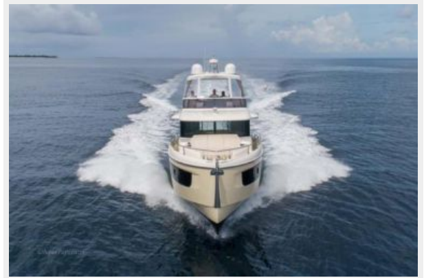
Underway - Bow