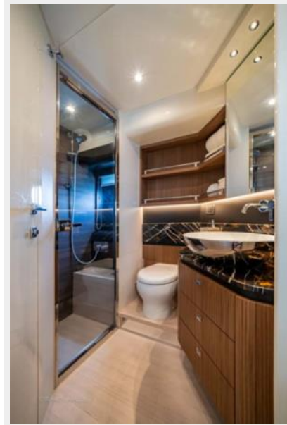
VIP Guest Head