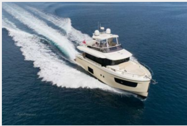
Underway - Starboard Forward