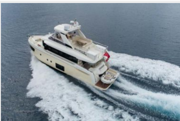
Port Aft Running