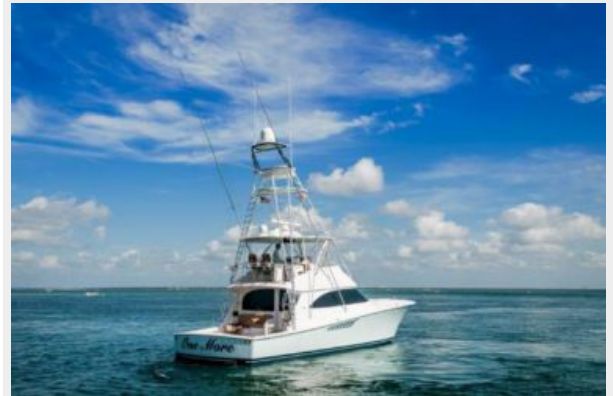
2013 55 Viking Convertible Stbd Profile