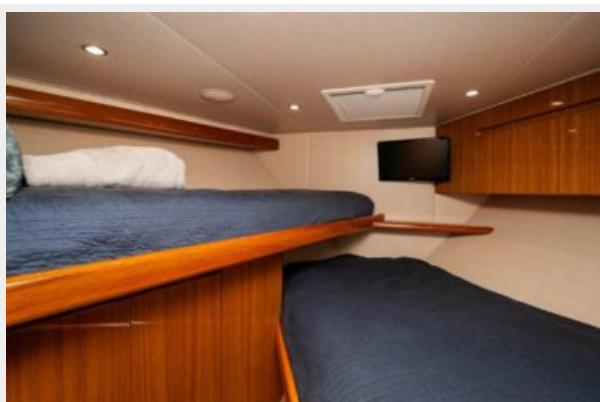
013 55 Viking Convertible VIP SR