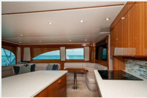
2013 55 Viking Convertible Galley