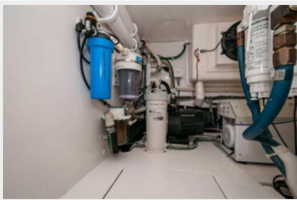
2013 55 Viking Convertible Water Maker