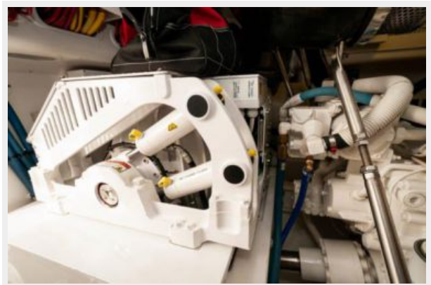
2013 55 Viking Convertible Seakeeper