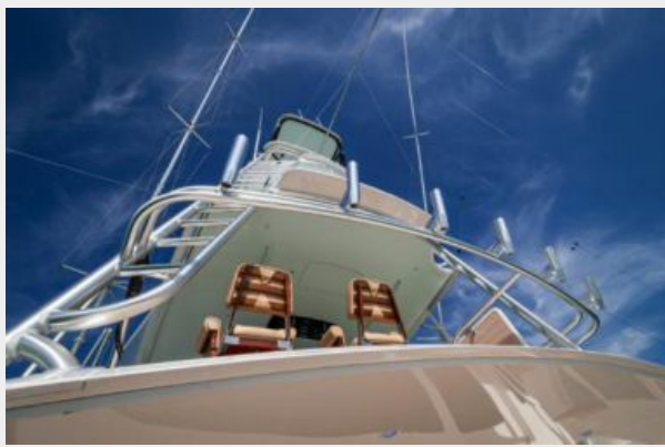
2013 55 Viking Convertible Tower