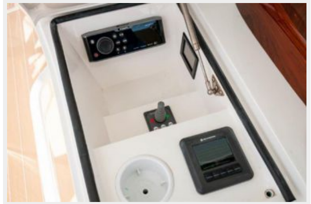
2013 55 Viking Convertible Helm