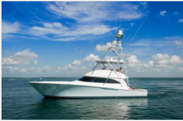
2013 55 Viking Convertible Port Profile