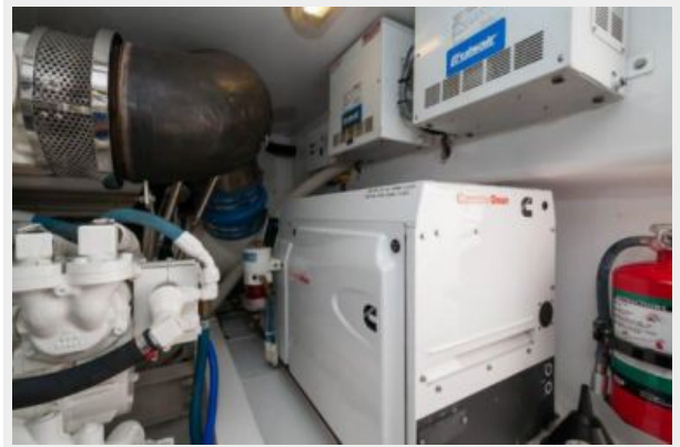
2013 55 Viking Convertible Generator