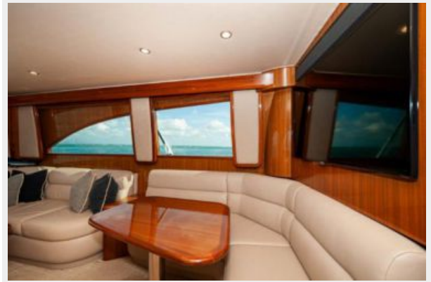
2013 55 Viking Convertible Dinette