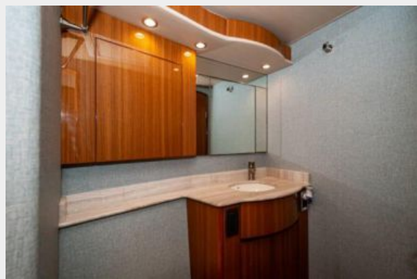
2013 55 Viking Convertible VIP Head