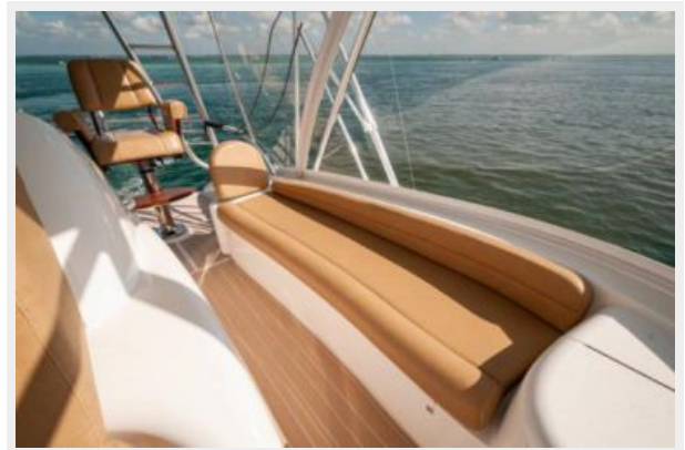
2013 55 Viking Convertible Flybridge