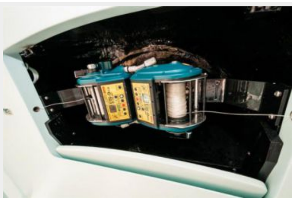
2013 55 Viking Convertible Teaser Reels