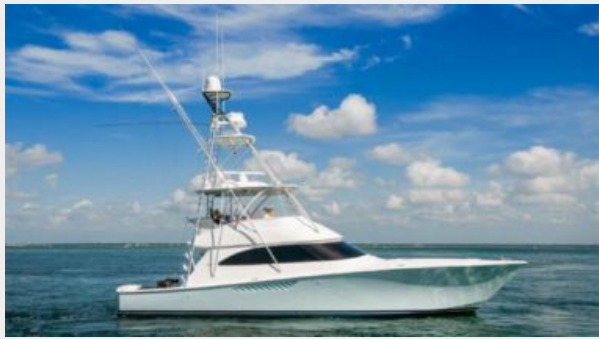
2013 55 Viking Convertible - Profile