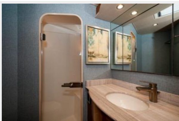
2013 55 Viking Convertible Master Head