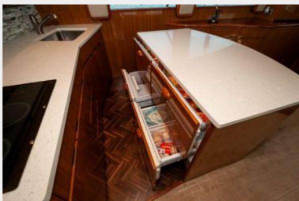
2013 55 Viking Convertible Galley