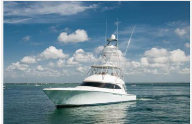
2013 55 Viking Convertible Port Bow