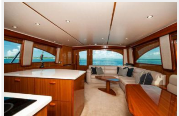
2013 55 Viking Convertible - Salon