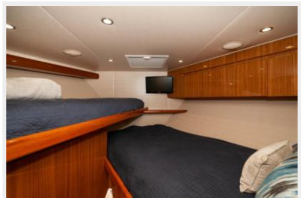
2013 55 Viking Convertible VIP SR