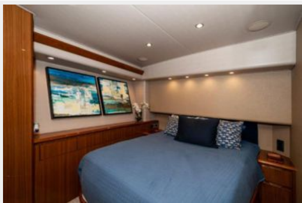
2013 55 Viking Convertible Master Stateroom