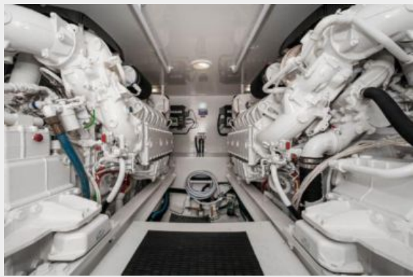
2013 55 Viking Convertible Engine Room