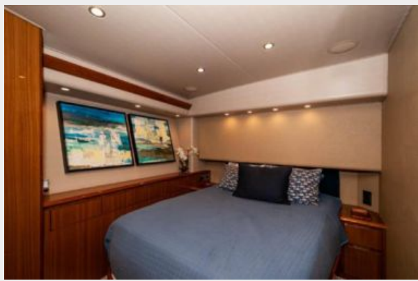
2013 55 Viking Convertible Master Stateroom