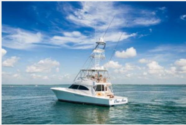
2013 55 Viking Convertible Transom Profile