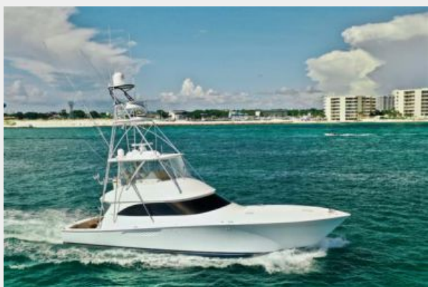
2013 55 Viking Convertible Starboard Profile