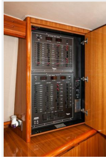
2013 55 Viking Convertible Breakers