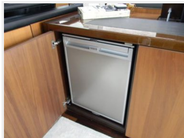
Upper Salon Refrigerator