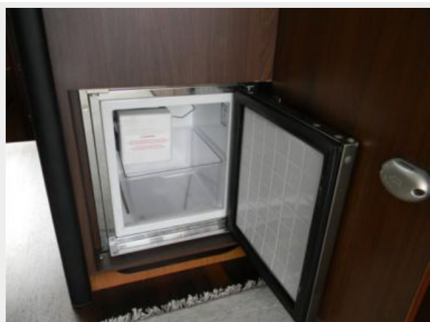
Upper Salon Icemaker