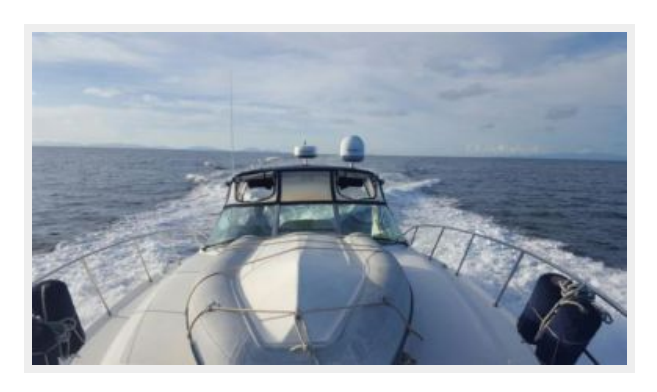
Here we go! actual boat