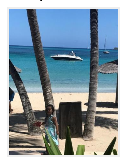
Perfectly framed actual boat