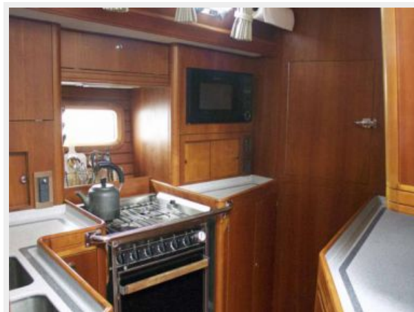
Galley, Looking Aft