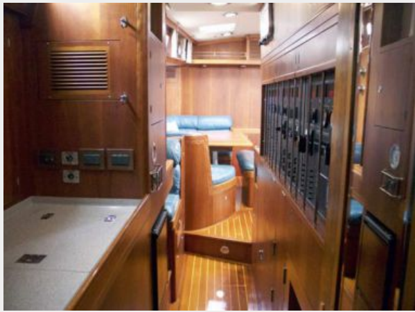
Aft Passageway, Looking Fwd.