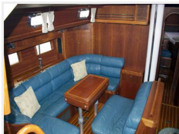
Dinette Table, Folded