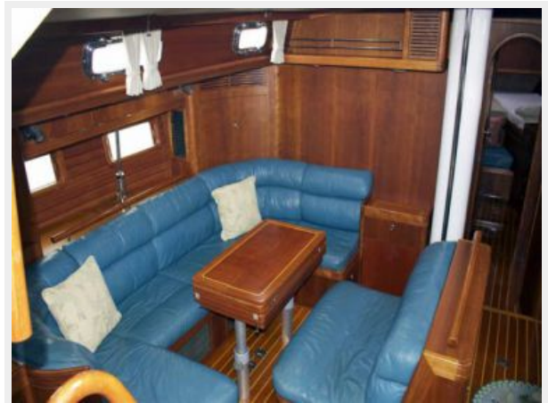
Dinette Table, Folded