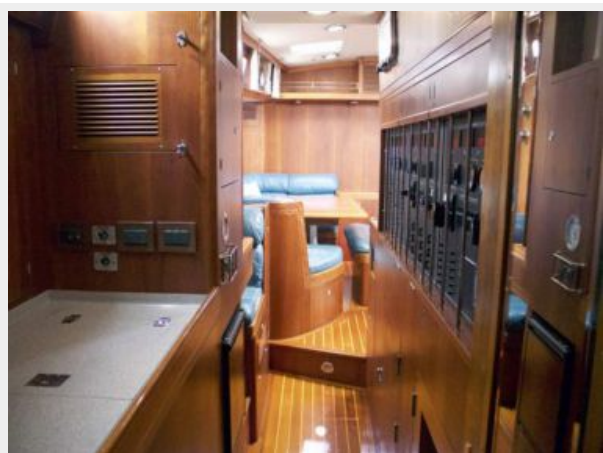
Aft Passageway, Looking Fwd.