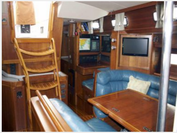
Salon, Looking Aft