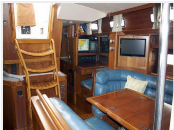
Salon, Looking Aft