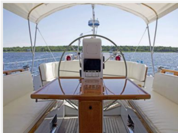
Cockpit Table Extended