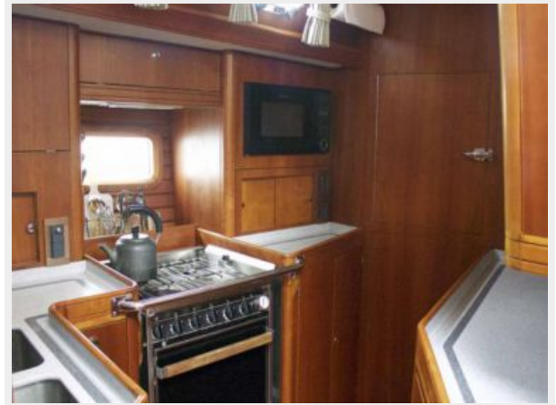
Galley, Looking Aft