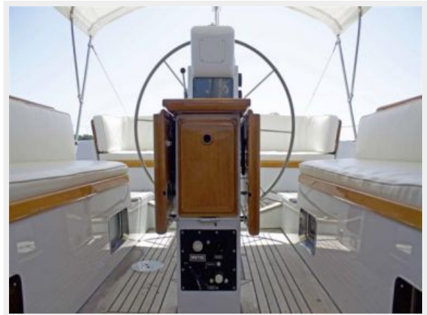
Cockpit, Looking Aft