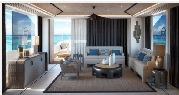
Dynamiq GTT165 int5