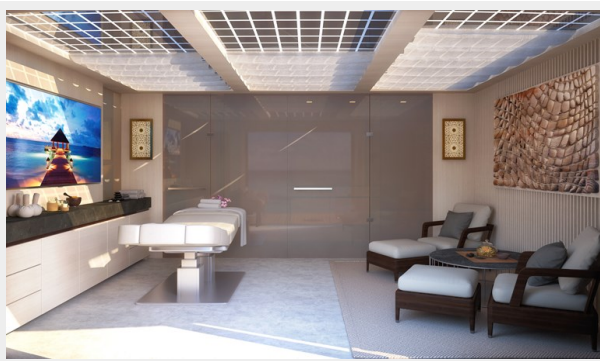
Dynamiq GTT165 int15