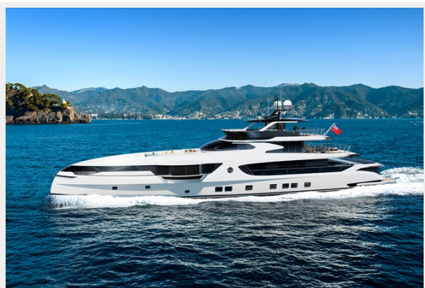
Dynamiq GTT165 002