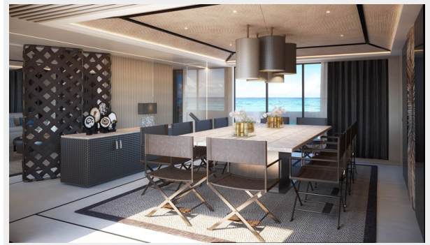
Dynamiq GTT165 int2