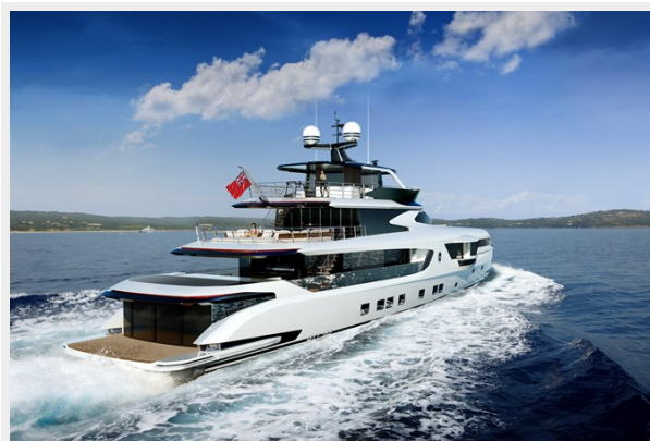
Dynamiq GTT165 005