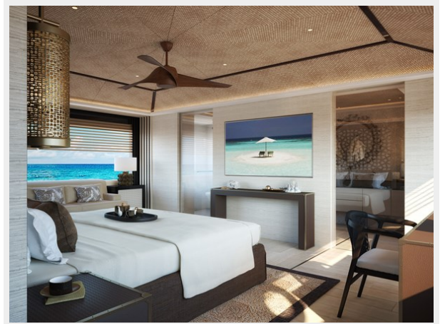
Dynamiq GTT165 int10