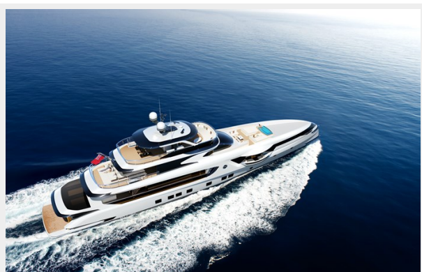
Dynamiq GTT165 006