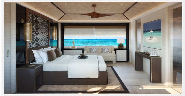
Dynamiq GTT165 int10