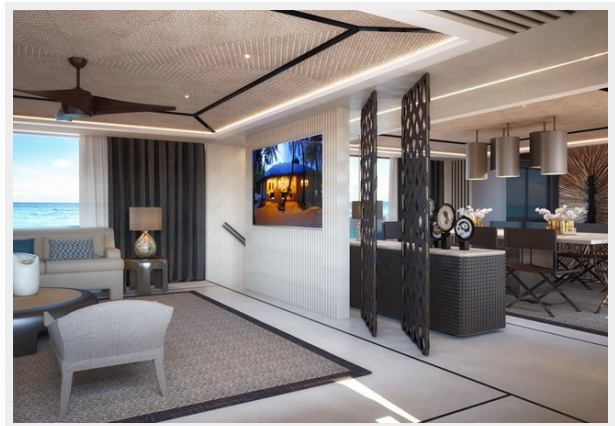
Dynamiq GTT165 int4