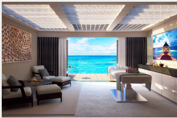
Dynamiq GTT165 int13