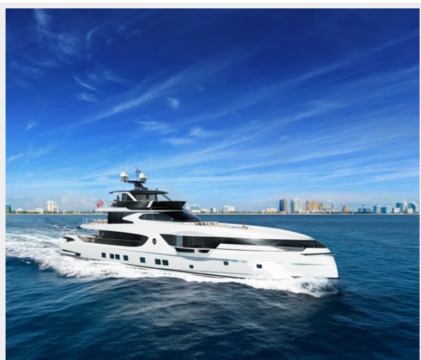
Dynamiq GTT165 004