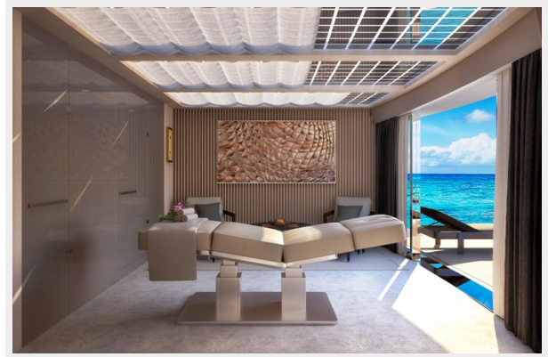
Dynamiq GTT165 int14