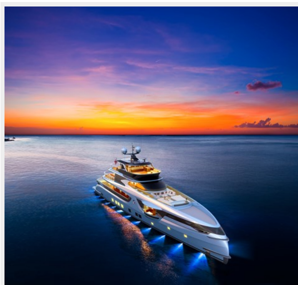
Dynamiq GTT165 003