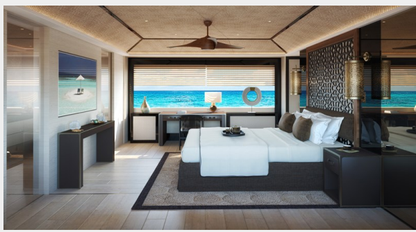
Dynamiq GTT165 int9