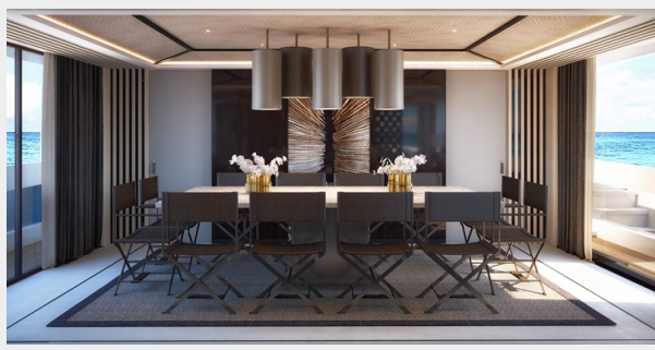
Dynamiq GTT165 int1