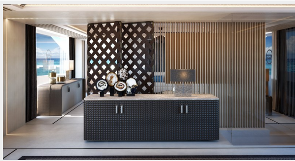
Dynamiq GTT165 int3