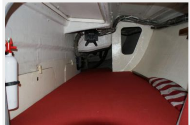
Aft Berth Close up