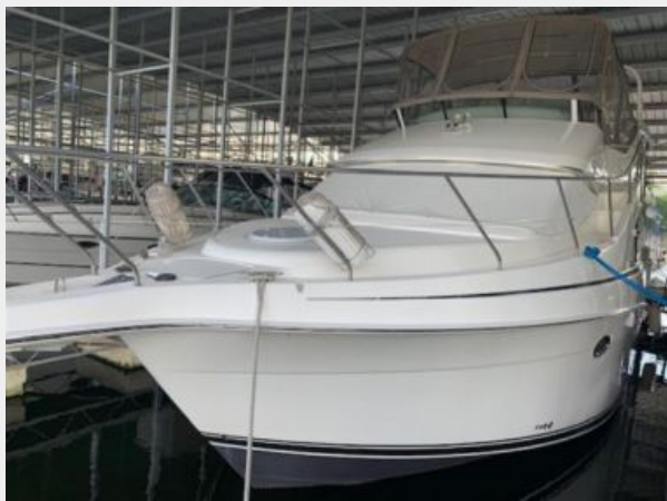
3 2007 Silverton 35MY Aft Port Profile