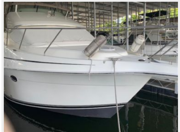
2 2007 Silverton 35MY Aft Starboard Profile