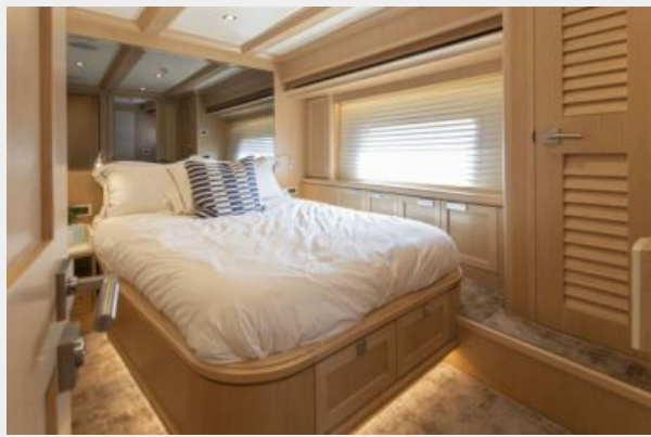
Midship VIP Stateroom