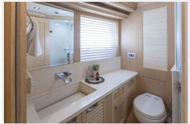
Midship VIP Stateroom Head