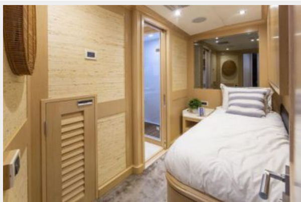
Starboard Bunk Stateroom