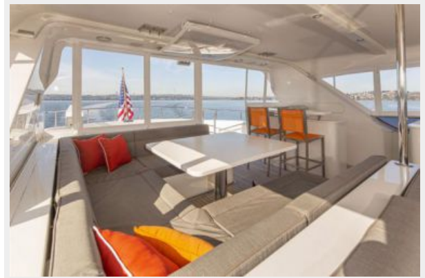
Enclosed Flybridge Seating