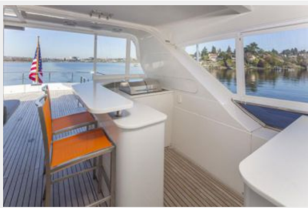
Flybridge Bar and BBQ