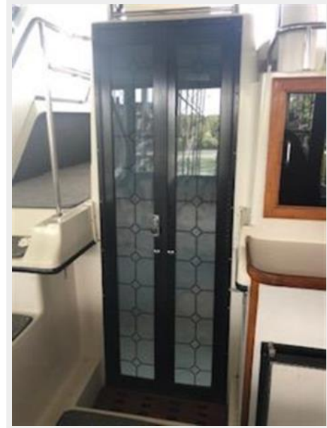
#11 Main entrance to salon from sundeck