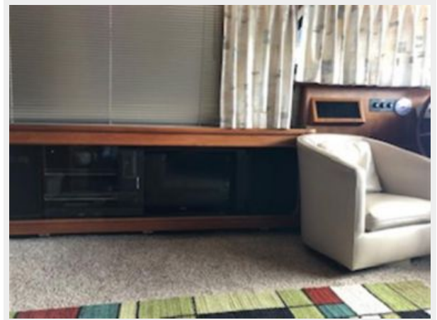
#17 Salon Port Side