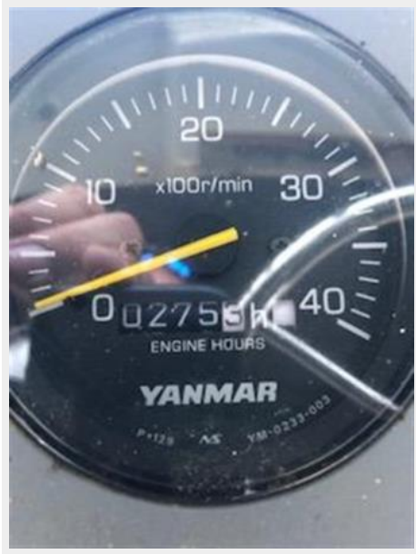
#36 Port Side Engine