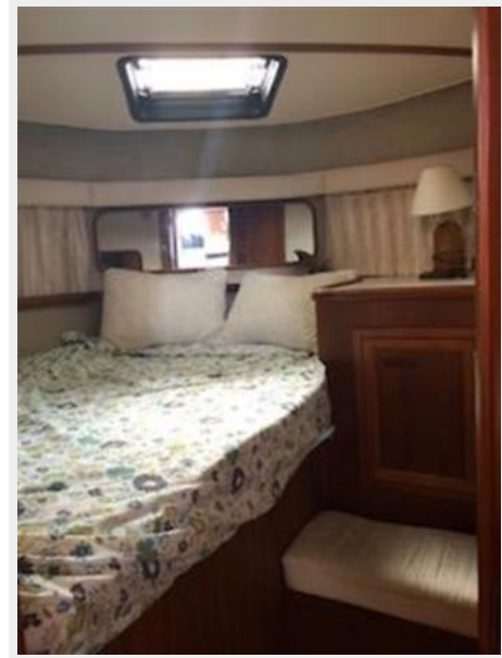
#25 Forward V-berth