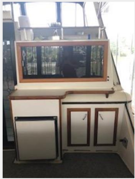
#10 Sundeck Area