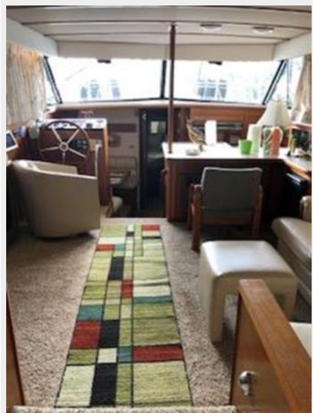
#12 Salon Area