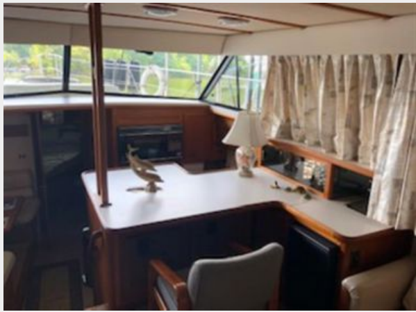
#20 Wet bar and upper table