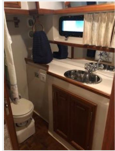
#29 Aft Head