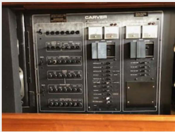
#16 Electrical Panel