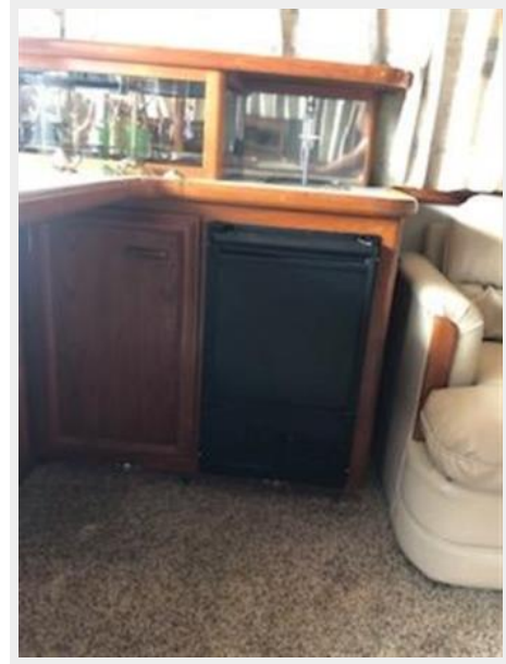
#21 Wet bar in salon