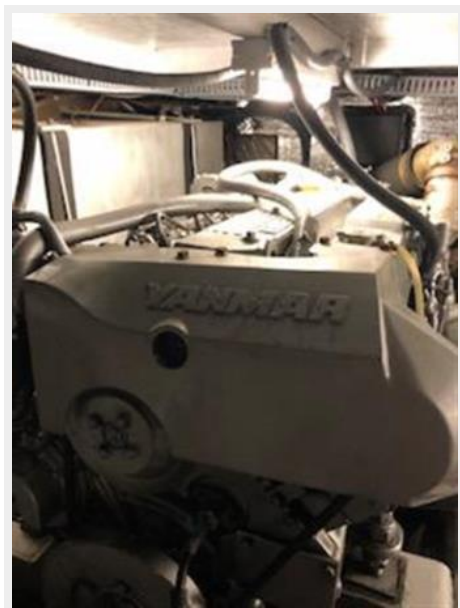
#42 Starboard Yanmar Engine