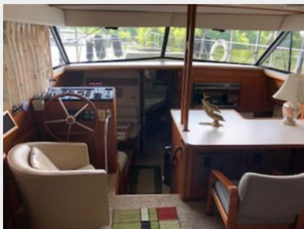
#18 Forward View from Salon