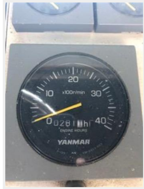
#37 Starboard Side Engine