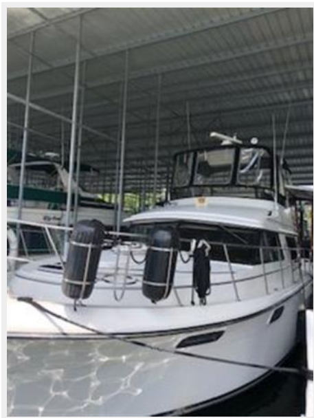
#2 Port Side