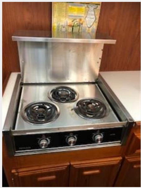
#24 3-burner Galley Stove