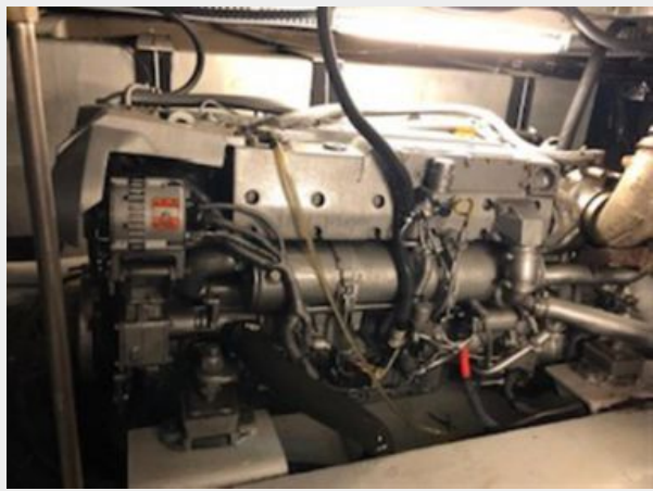
#44 Starboard Yanmar Engine side view