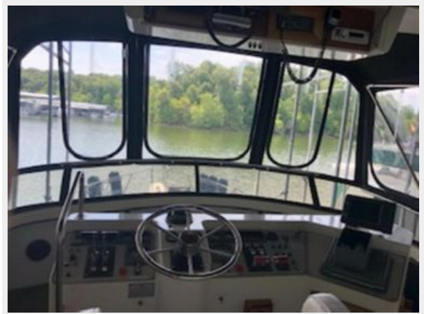
#7 Upper Helm