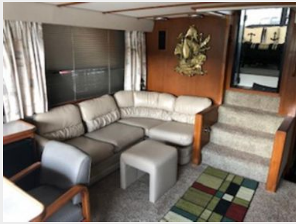
#14 Salon Area