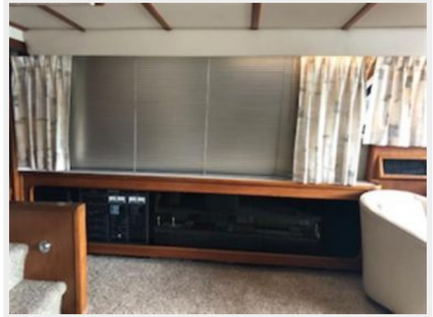
#15 Salon Port Side