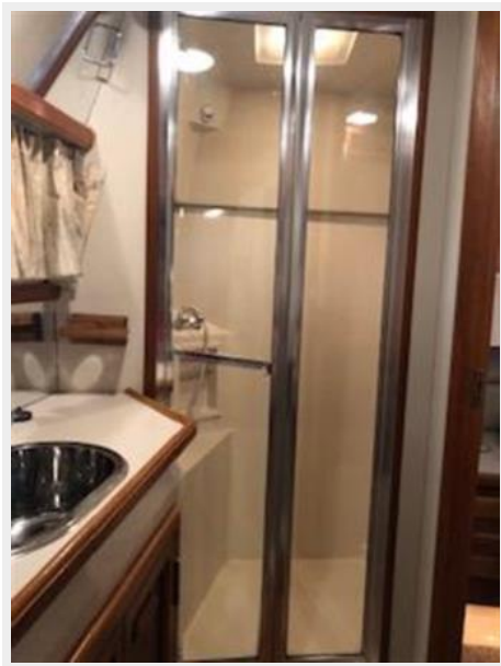
#30 Aft Shower