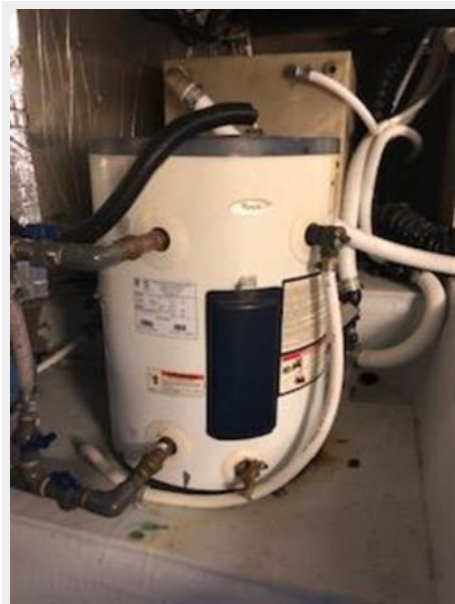
#34 Hot Water Heater