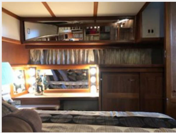
#28 Aft Cabin Port Side