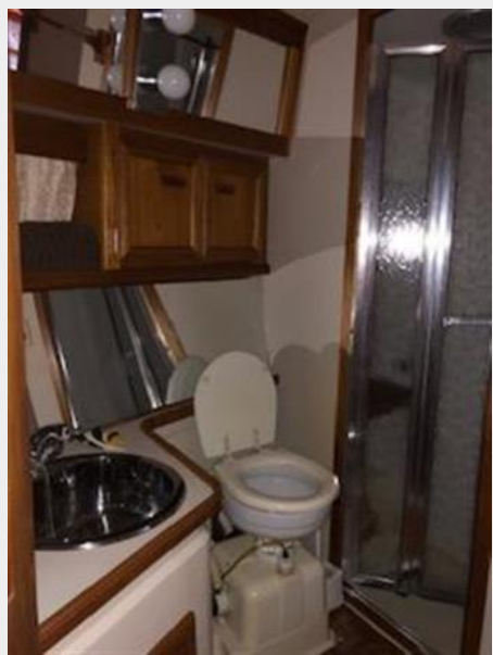
#26 Forward Head Shower