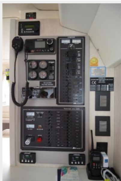
Electrical and Navigational