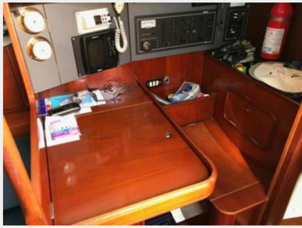
7214066_20190912112758464_1_XLARGE - Copy