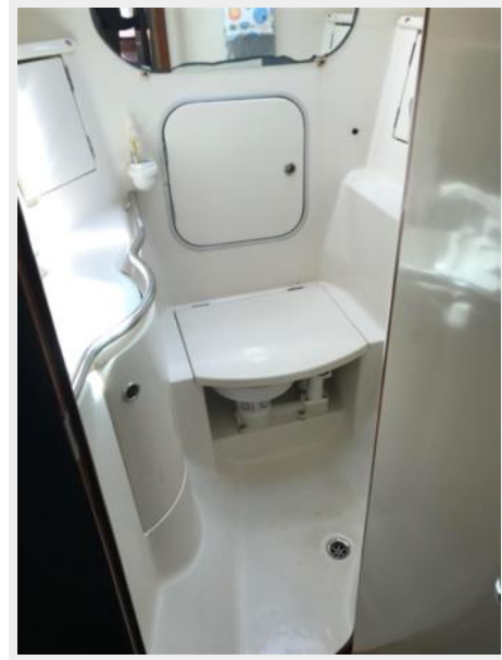
7214066_20190912113014870_1_XLARGE - 7214066_20190912113013008_1_XLARGE - Copy