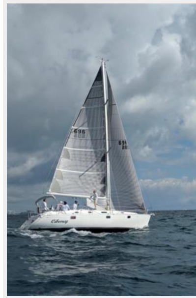
7214066_20190916093134002_1_XLARGE - Copy