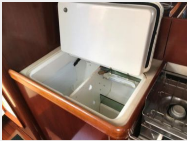
7214066_20190916095732497_1_XLARGE - Copy