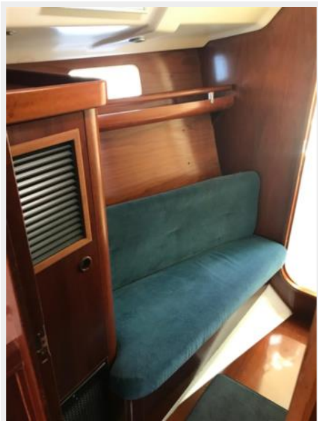
7214066_20190916093138407_1_XLARGE - Copy