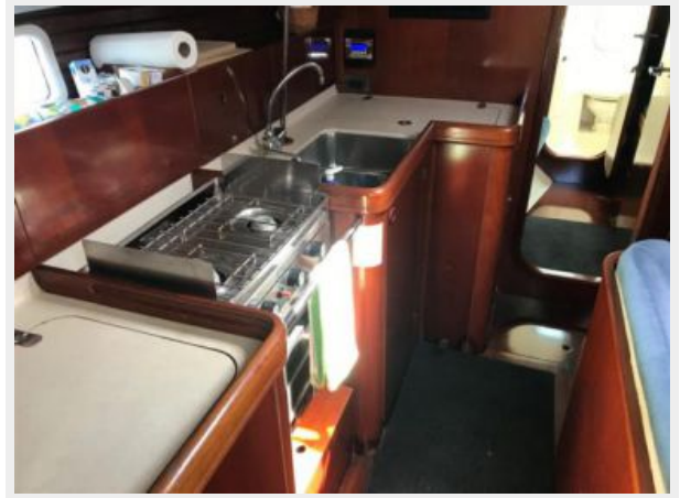
7214066_20190912113009825_1_XLARGE - Copy