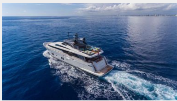
Port Profile Running