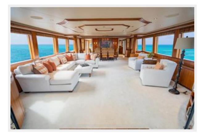
Main Salon / Dining