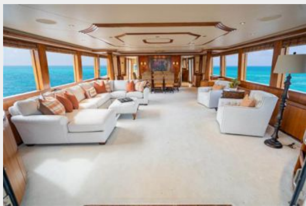
Main Salon / Dining