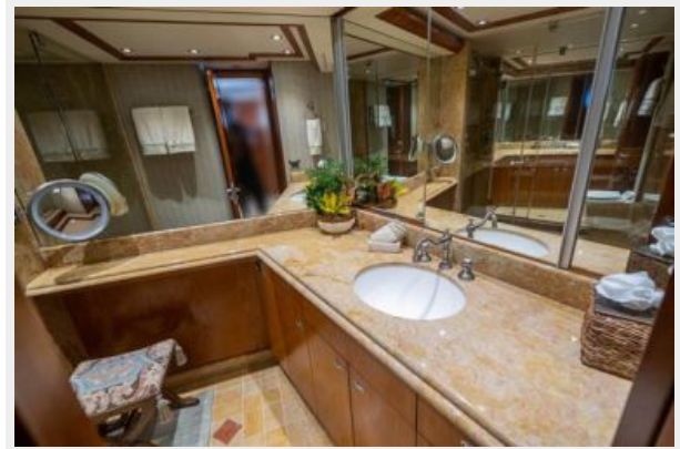
VIP Guest Stateroom