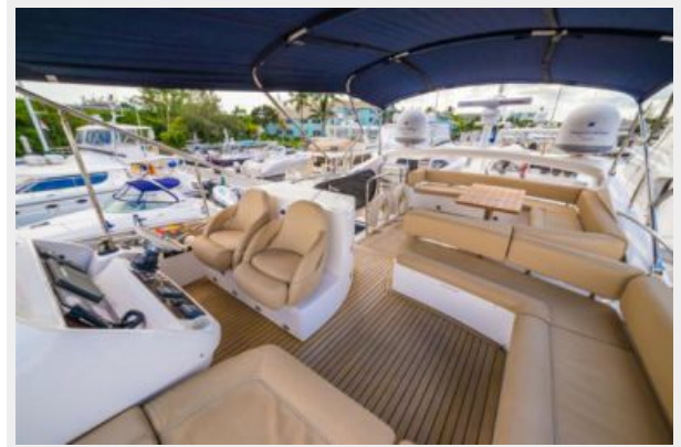
Liquid Fusion- Flybridge 4