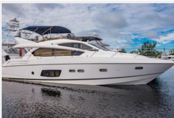
Exterior 2 - Copy