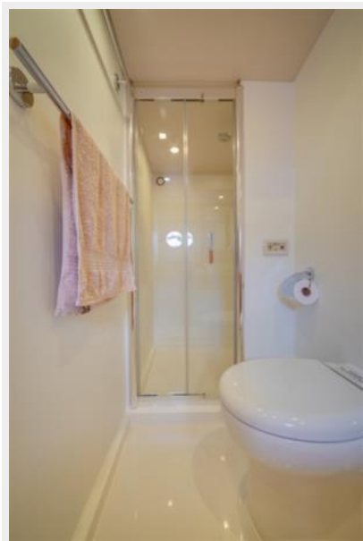
Master Head 1