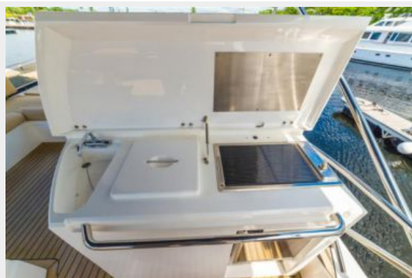
Flybridge 9 - Copy