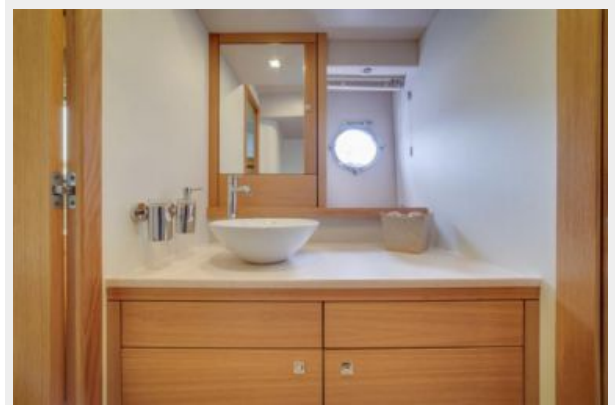
Master Head 2