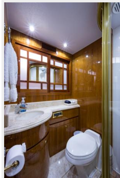
Guest Bath - Fwd. Stbd.