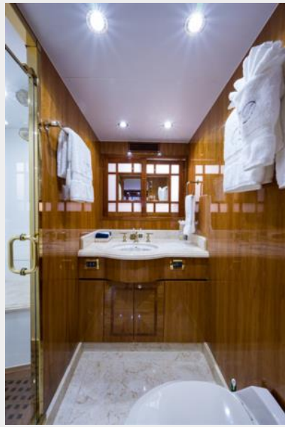
Guest Bath - Fwd. Port