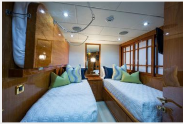
Guest Twin Stateroom - Mid Port