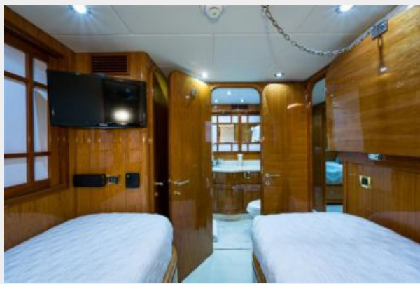
Guest Twin Stateroom - Mid Port