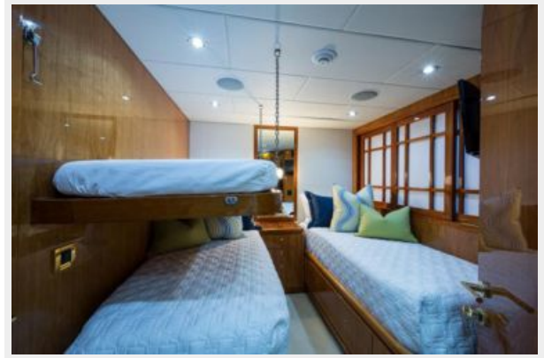
Guest Twin Stateroom with Pullman - Mid Port