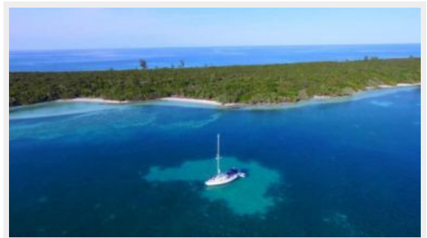
7234817_20191001102716282_1_XLARGE - Copy