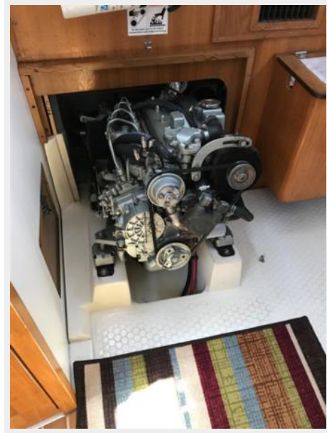
7234817_20191001103422172_1_XLARGE - Copy