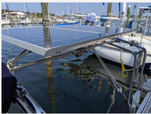
7234817_20191001104037655_1_XLARGE - Copy