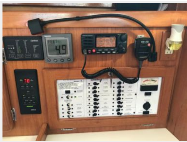
7234817_20191001184706496_1_XLARGE - Copy