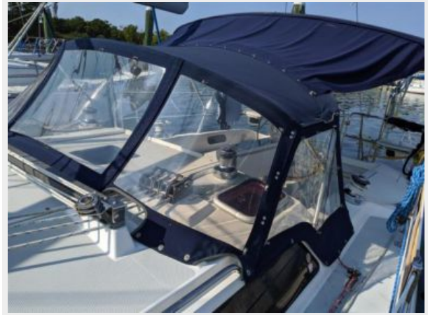
7234817_20191001103455052_1_XLARGE - Copy 7234817_20191001103412682_1_XLARGE