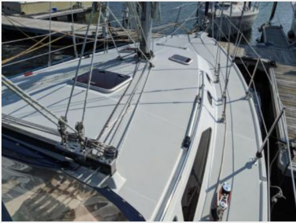
7234817_20191001103528394_1_XLARGE - Copy 7234817_20191001103503537_1_XLARGE - Copy