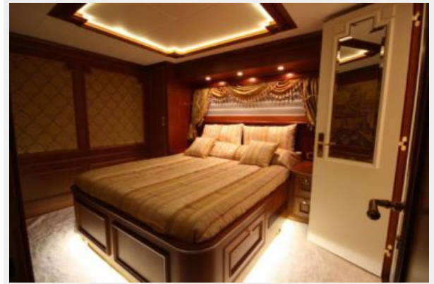
21-VIP cabin №2