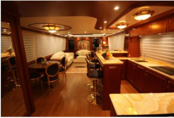
9-Main deck entrance