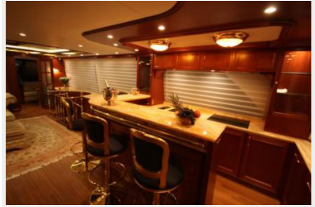
10-Main deck cockpit