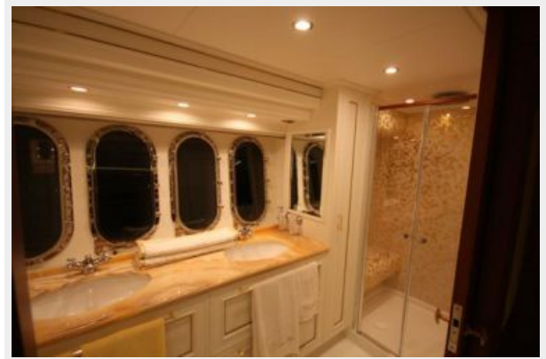
17-Master cabin head