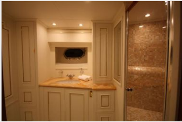
20-VIP cabin №1 head