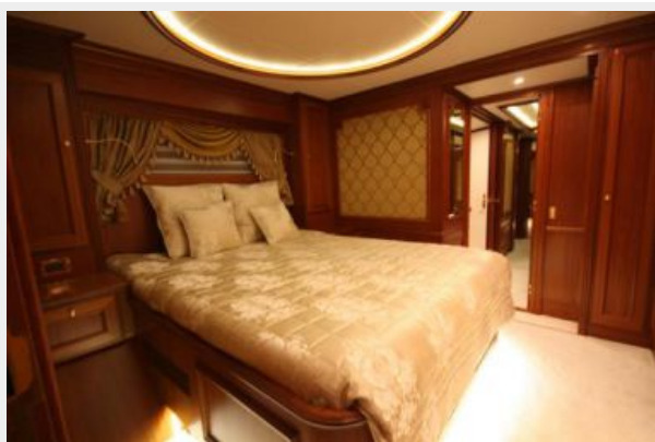
18- VIP cabin №1