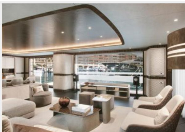
Dynamiq G500 int7