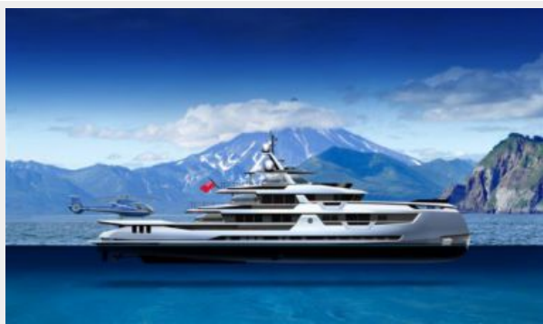
Dynamiq G500 003