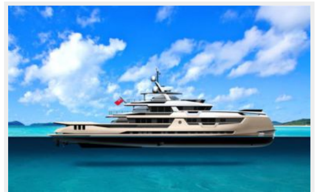
Dynamiq G500 004