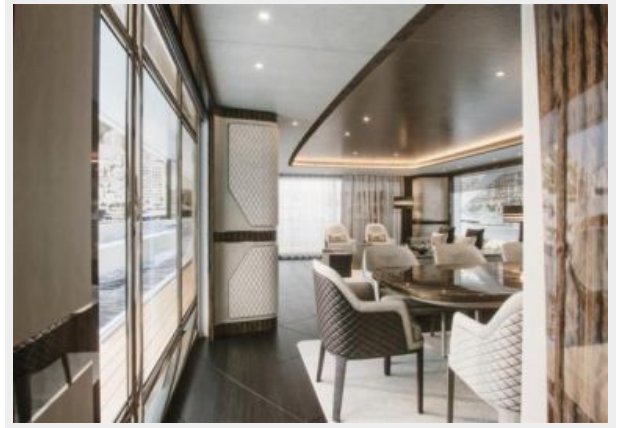
Dynamiq G500 int4