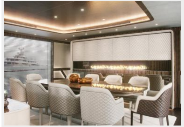
Dynamiq G500 int10