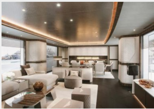
Dynamiq G500 int5