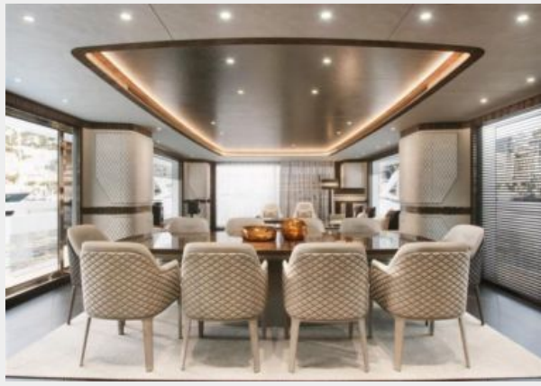
Dynamiq G500 int3