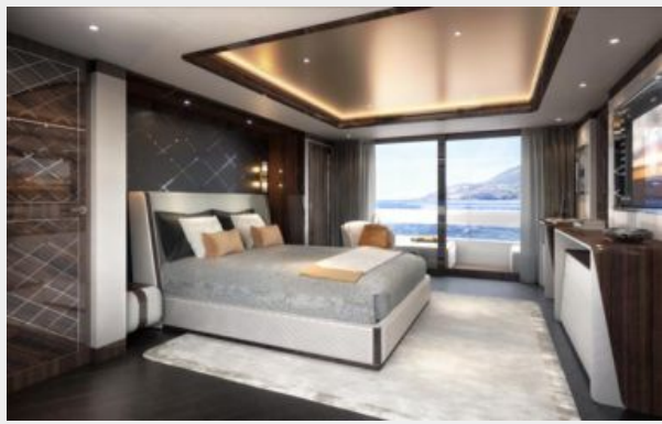
Dynamiq G500 int11