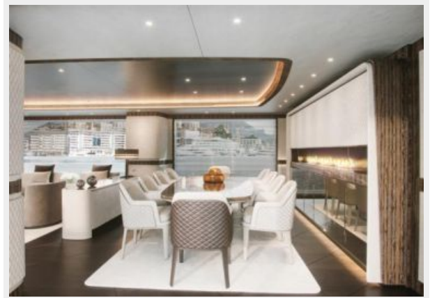
Dynamiq G500 int6