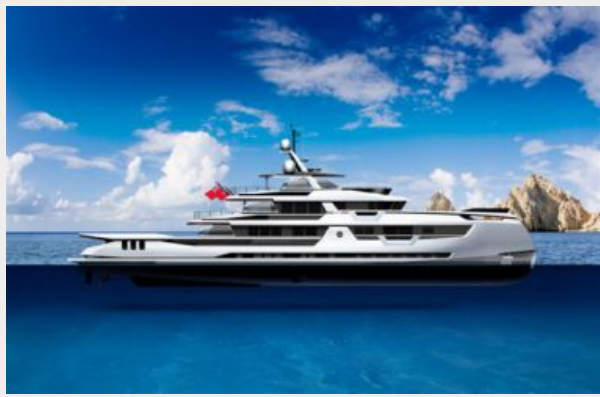
Dynamiq G500 001