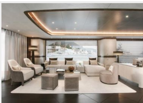
Dynamiq G500 int1