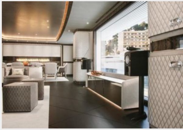
Dynamiq G500 int9